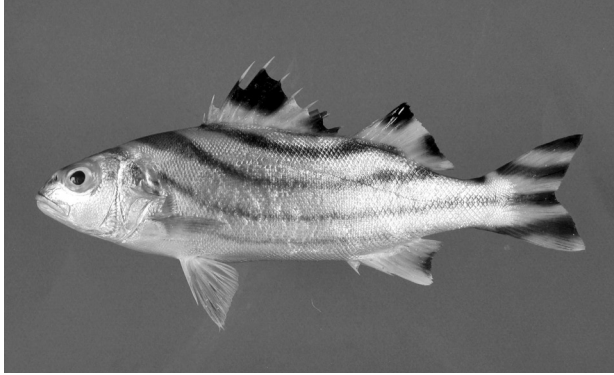
FIG. 1. – Terapon jarbua , 170 mm standard length, from Dor, Mediterranean coast of Israel, HUI 19845.

mm (total length, 213 mm) and a weight of 120.8 g was hooked in very shallow water ( ca. 0.5 m) on the Mediterranean coast of Israel, at Dor (Tantura), ca. 25 km south of Haifa (Fig. 2). The specimen was deposited in the Hebrew University Fish Collection (HUI) and received the catalogue number HUI 19845.