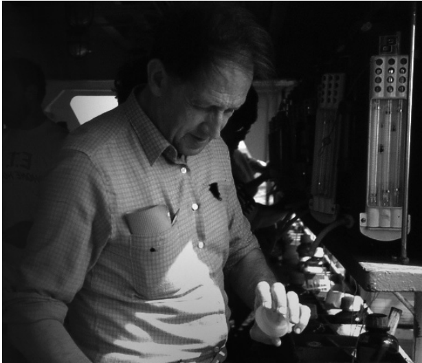
Ramon Margalef during his last research cruise aboard the R/V García el Cid in the Mediterranean in 1999.

lorca and, like any good islander, she did not want to be far from her home town. In Latin America he had many contacts, starting with Venezuela. He also established links with an oceanographic laboratory on Isla Margarita and this “bridge” was operative for many years. The plankton samples collected in the Caribbean were fixed and sent to Barcelona to be studied by Margalef.