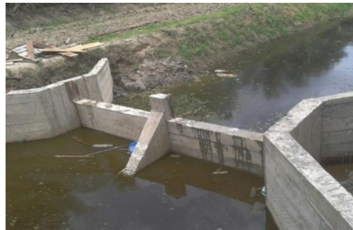
Figure 1. Canal blocking is ready to use for water