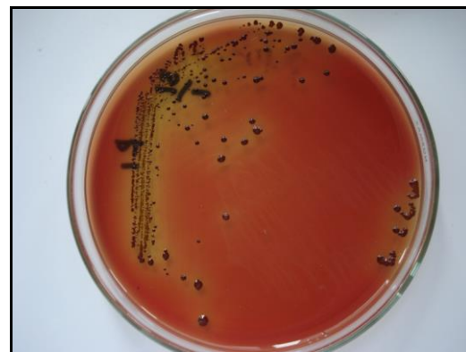
Figure 1. Bacterial colony of P. gingivalis ATCC 33277 on the 14 th day

After culturing in blood medium, we obtained the result of colony of P. gingivalis bacteria. Figure 1 showed the results of bacterial culture isolation of P. gingivalis ATCC 33277 on day 14, which on this day the bacterial harvesting of isolated OMP. Colonies of these bacteria have a characteristic brown or black pigment on blood agar.