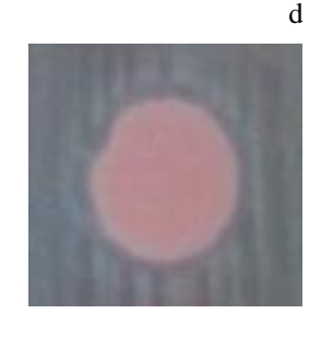
Figure 1. Inhibition zone of staphylococcus aureus bacteria around the samples