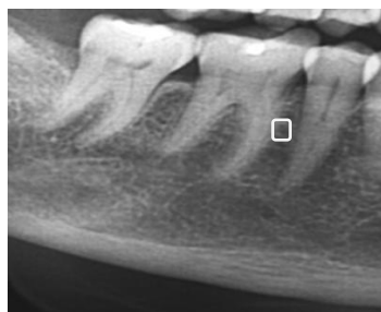
Figure 2. The box with size of 30x30 of premolar distal was made from the centre of ROI