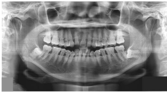
Figure 1. The picture of panoramic radiograph