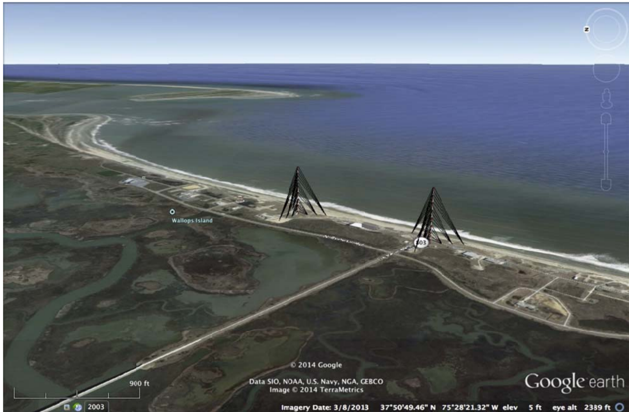
Figure 2. Three-dimensional rendering of potential tower sites. Guy wires depicted are worst-case and would likely be fewer per tower leg.