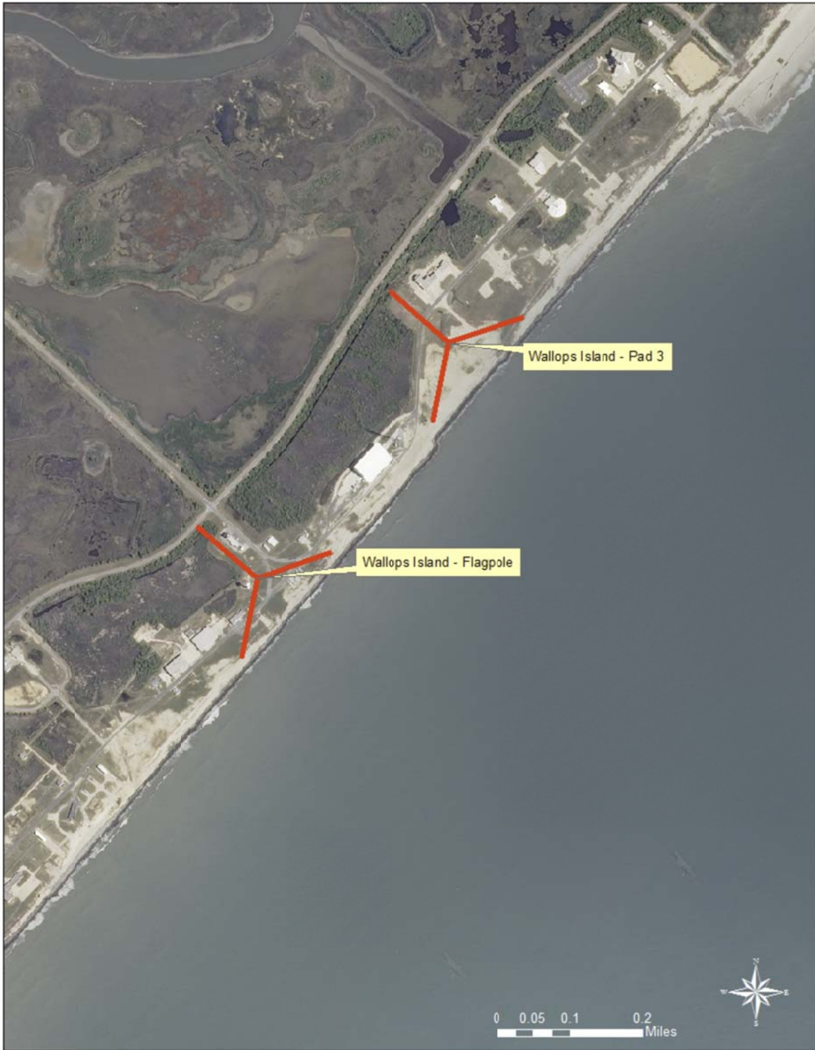
Figure 1. Aerial view of remaining tower sites after NASA’s site review process.