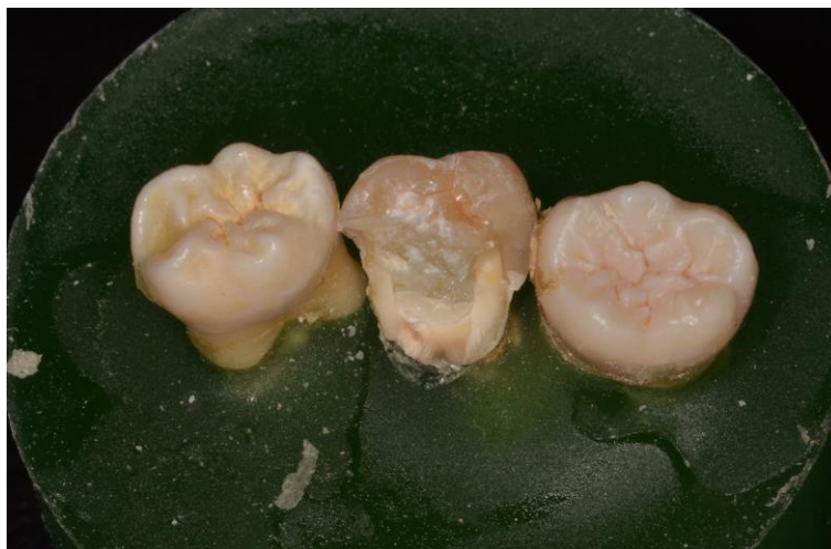
Figure 3. Fracture pattern deemed unrestorable as it extends under the CEJ.

Furthermore, apart from determination of the load required for fracture, evaluation of the fracture type is important from a clinical point of view. Thus, whenever conducting a load-to-fracture test, not only the fracture resistance, but also the failure mode should be evaluated. After the mechanical testing, the fractured specimens are examined regarding their fracture patterns. According to Scotti and co-workers, distinction is made between restorable or nonrestorable fractures under optical microscope with a two-examiner agreement. Based upon their evaluation system, a restorable fracture is above the CEJ, meaning that in case of fracture the tooth can be restored, while a nonrestorable fracture extends below the CEJ and the tooth is likely to be extracted [14] (Figure 3).