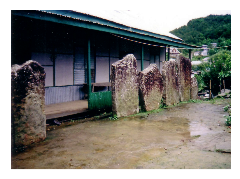
Fig. 3. Stone alignment.

As discussed earlier, carvings are depicted on most of the standing stones. But on other types such as stone seats, cairns and stone platforms, there are no carvings at all. The figures carved on the upright stone include figures of humans, animals (specially the mithun), birds, spears, guns, smoking pipes and prestige goods such as gongs, necklaces and the like. The technique of carving differs from one stone to the next. Thus while some figures are deeply engraved, others are not. The standing stones are again divided into three groups based on the carving technique: