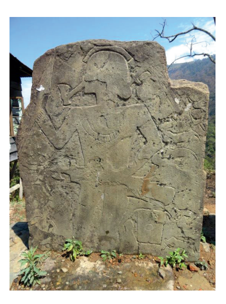
Fig. 6. Incised /Deep-cutting, Chhura Farep at Lenchim village.

Malsawmliana A Typological Classification of Megaliths of Mizoram 6 December 2019