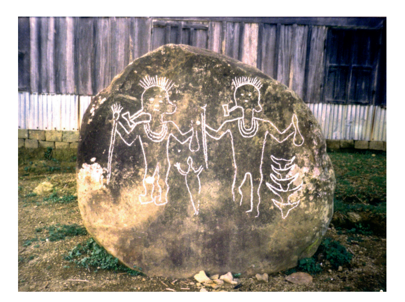
Fig. 5. Engraving of figures/scratching, Ridawpi Lung at South Sabual village.