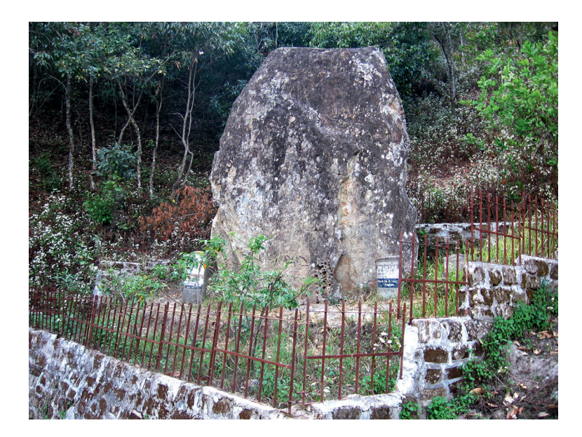
Fig. 4. Single standing stone, Lungphun lian at Lungphunlian village.

• Engraving of figures in high relief or embossing: With this method, the figures are first engraved in high relief and then the rest of the outer layer of stone is chiseled off so that the figure appears to bulge out of the main frame, which gives the impression of embossing. The engravings are smooth and plain and are of higher quality than those using the previous method. Such kinds of carvings can be seen in Kawtchhuah Ropui, Mangkhaia Lung and Lungphunlian (fig.7).