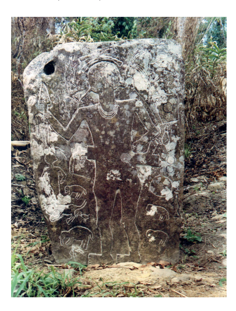
Fig. 2. Single standing stone, Lungphun lian at Pukzing village.