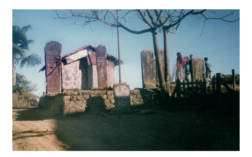
Fig. 9. Stone platform with upright stone.

to await their parents return from their jhum fields. Among the Mara clans who occupy southern Mizoram, the stone platform ( Longdoh/lodawh in Mara dialect) is regarded as a memorial restricted to the chiefs and wealthy persons in the society. The longdoh , which measures about 2 m in length, 2 m in width and 1 m in height, is usually located at the entrance of the village. Each platform ( longdoh ) is made up of a number of stones each of which measures 60 cm in length and 30 cm in breadth. Thus the longdoh takes the form of a square enclosed by four stone walls about 90 cm high, and the void between is then filled up with soil and a flat stone placed on it (Fig. 9).