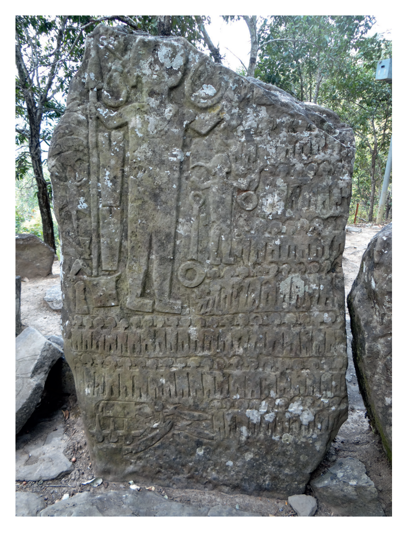
Fig. 7. Figures in high relief or embossing, Kawtchhuah Ropui at Vangchhia.