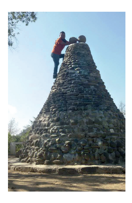
Fig. 10. Cairn, Phura.

Thus we see different types of megalithic structures in Mizoram which we see in other parts of the world. As mentioned earlier, the purpose and significance of the megalithic tradition in society differed from tribe to tribe and from culture to culture. Unlike others, the significant features of Mizo megaliths are the components of its engravings, and interestingly most of the Mizo megaliths are full of carvings of different pictures.