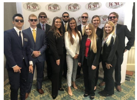
Sales team members keeping their cool during the competition in Orlando, FL.

This year, two Parker College of Business students advanced to the role-play quarter finals, the highest position the team has ever achieved. In the end, three of our sales students were offered jobs at the competition, while the rest of the students in attendance were interviewed for sales careers and are currently pursuing offers from the companies interviewing them.