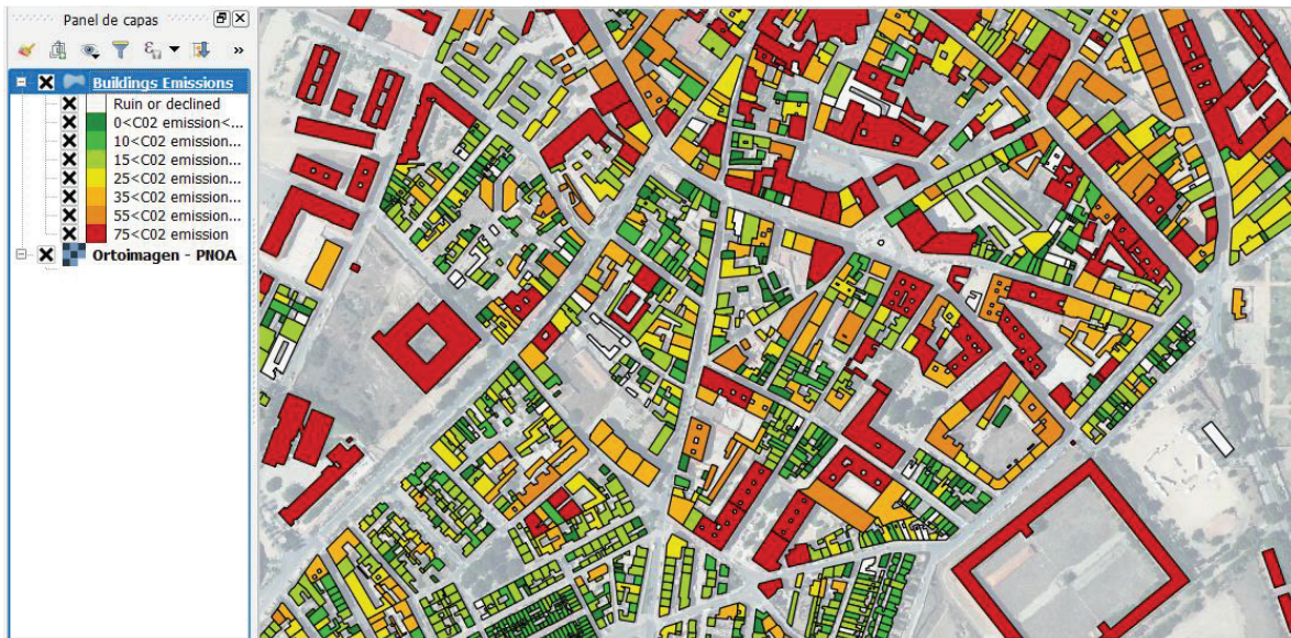
Figure 3: Estimation of the CO 2 emissions in the municipality of Medina del Campo using the tool