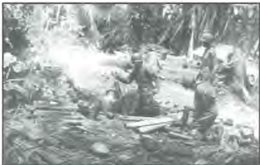
"Fire one" - H. Company 81 mortar crew near Point Cruz, Guadalcanal. Nov. 1942.

Final details on hotel room costs and registration data will be in the September issue of the 1 64th news.