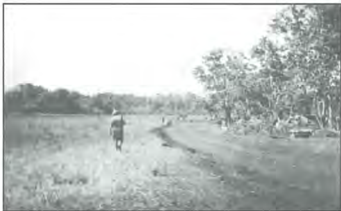
Walking the wire, Oct. 1942. E. Co. position, 1/2 mile from Henderson Field. Every morning a designated soldier had to walk along the barbed wire to check if the Japs had cut the barbed wire and infiltrated the 164th defense line. Generally a tense duty as no doubt the Japs were watching.