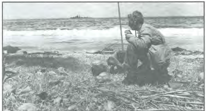
Ship-to-shore communications to direct naval gun fire onto Japanese positions. U.S. Destroyer off Guadalcanal 1942-43. U.S. soldier with walkie-talkie on shore. Very effective method for hitting enemy positions.