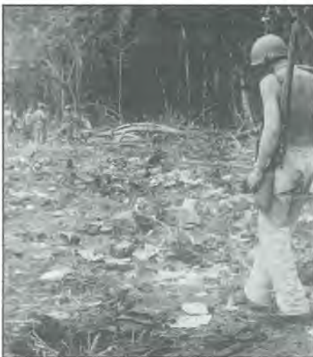
"Jap Debris" after the battle for Henderson Field.