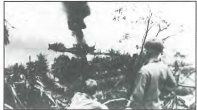
Last night it was a Jap troop ship. Nov. 13/14-'42, Point Cruz, Guadalcanal. Members of A Co. 164th watching the demise of Jap Ship.