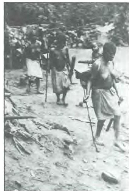
Native women and children on Bougainville, 1944.

The Department of Defense is already planning the 50th anniversary commemoration of the Korean War. It will be handled by the International Commemorations Committee of the Army International Affairs Office. Events and activities are scheduled to be launched on Memorial Day 1999 and continue until Veterans Day 2003. Numerous steps will be taken to publicize the contributions of Korean War veterans. The VFW will play a major role in this celebration. We will keep you posted on developments.