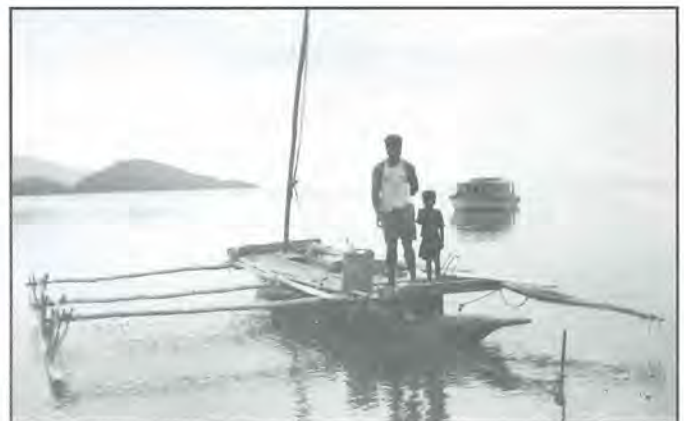
"Kanaka" native and his daughter using their outriggers canoe to supply water to 164th outpost in New Caledonia.

One generation passeth away, and another generation cometh: but the earth abideth forever.