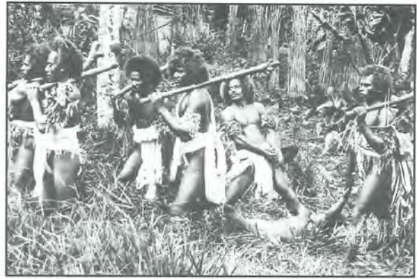
New Caledonia natives hunting and bringing home their kill to feed their families.