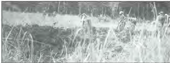
"Coffin Corner," right flank of 2nd Bn., 164th, right flank of Col. "Chesty" Puller' marine, 7th Marines. Burying detail after the Oct. 23-24, 1942, battle. The Japanese attacked at night screaming "Banzai, you die." Approximately 155 dead Japs hurried in this hole dug by shovels of the 164th. Not a pleasant job as the dead had been lying there for a day or two in the hot tropical sun.