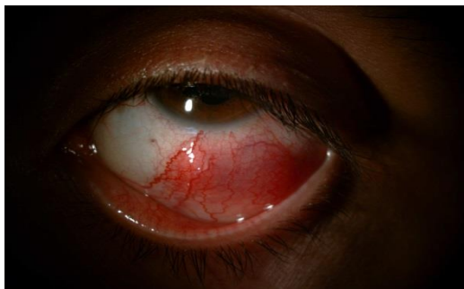
Figure 1. Appearance of nodular scleritis below the limbus of the left eye.

oral aphthous ulcers and papulopustular skin lesions for almost 10 years. He also had a history of lower extremity deep vein thrombosis. We found that the best-corrected visual acuity was 20/20 in the patient's right eye and 20/40 in the left. A slit-lamp examination revealed trace cells in the anterior chamber and vitreous of the right eye, and in the left eye, tender scleral nodules with a purplish hue (Figure 1) and grade 2+ cells in the anterior chamber and vitreous.