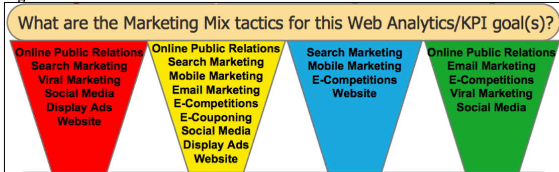
Components of Conceptual Model (Figure 3.3)

Figure 3.3 contains the components that help answer research question three: What does the literature suggest are the best digital marketing mixes for achieving a client’s web analytics goal(s)?