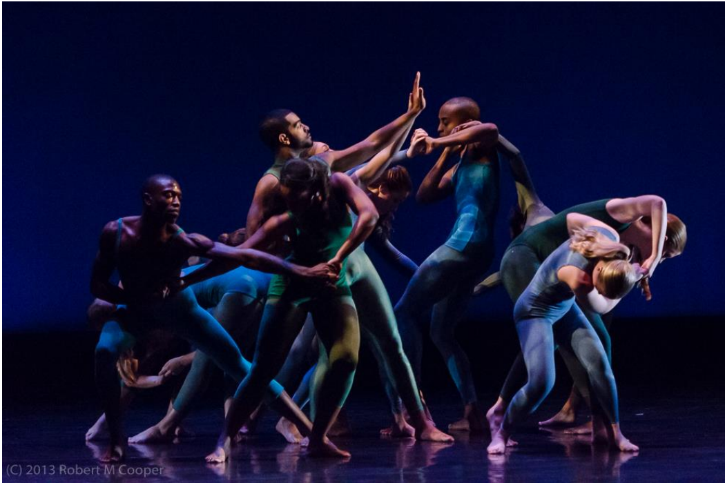
Figure 2. “Central Park in the Dark” from Scenes from the Music of Charles Ives as performed by Montclair State University dancers in 2012.