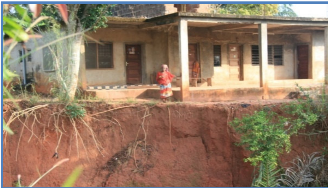
Plate 3.3: Residential Buildings under threat by gully at Amako, Nanka