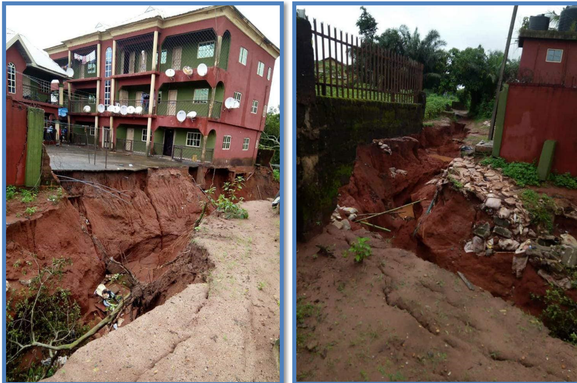
Plate 0.1: Gully Erosion Affecting the Environment in Niger Delta, Nigeria

destruction of homes, transportation and communication systems, contamination of water supply, isolation of settlements, migration of communities etc. The whole of South Eastern Geopolitical Zone is ravaged by gully erosion just as desertification threatens the North and crude oil-related pollution wrecks the Niger Delta but Anambra States condition has evolved to an epidemic intensity.