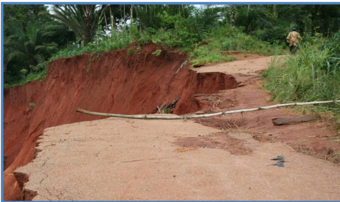
Plate 3.2: Road cut at Isiakpuenu, Nanka