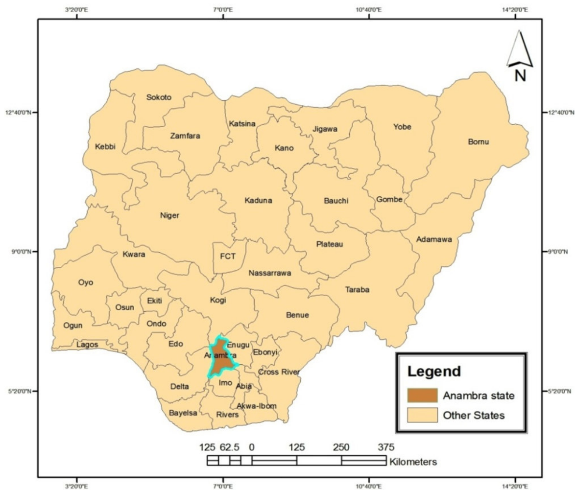
Figure 2.1 Map of Nigeria showing Anambra State where the study area is located