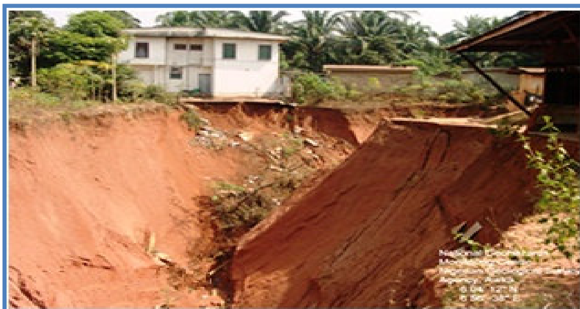
Plate 3.4: Residential Buildings under threat by gully at Amako, Nanka