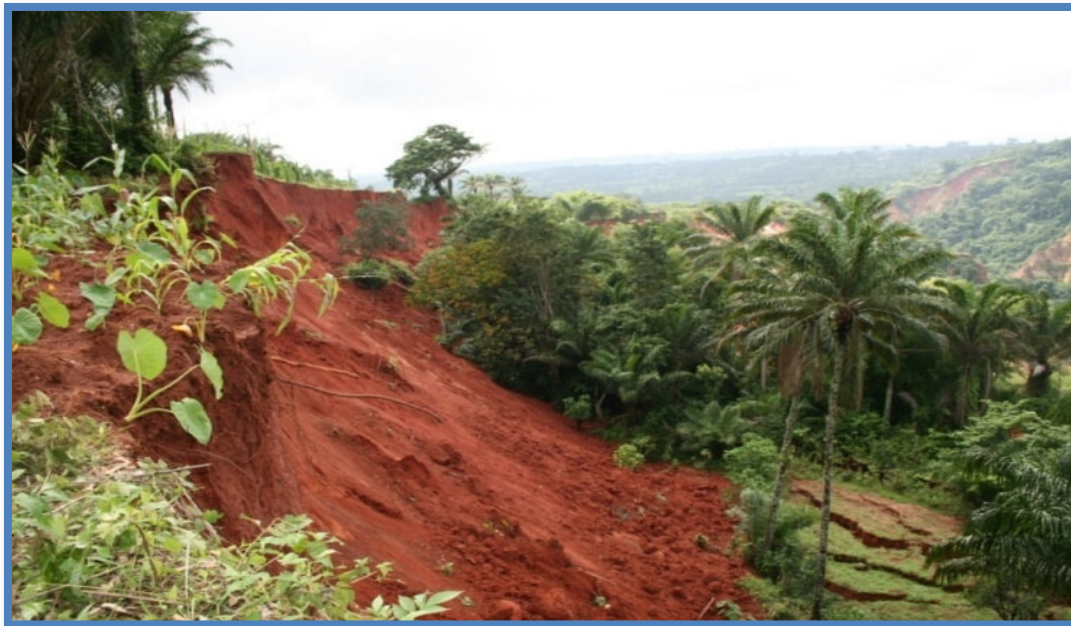
Plate 3.1: Debris slump at Isiakpuenu, Nanka