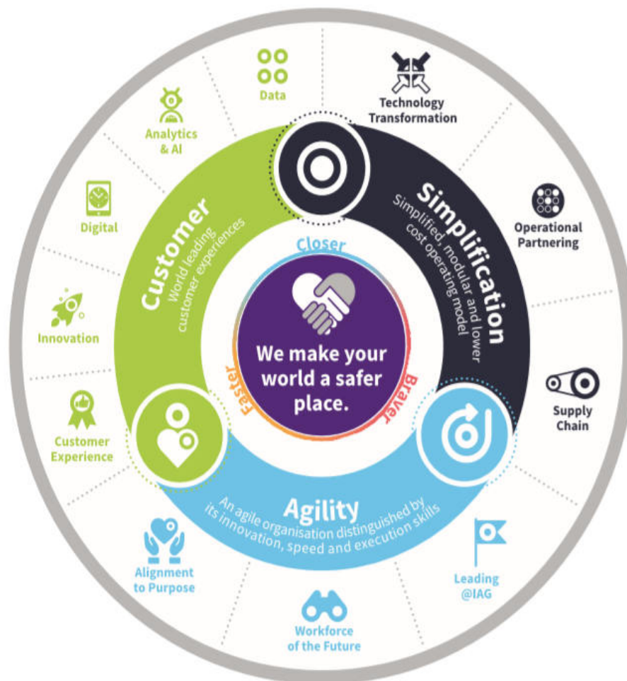
Figure 4: IAG Strategy

IAG strategy is based on the three major aspects as follows (Refer Figure 4: IAG Strategy): (1) customer - data analytics and digital innovation to enhance customer experience, (2) simplification – supply chain partnering for low-cost operational model, and (3) agility - agile organisation developing skilled future workforce.