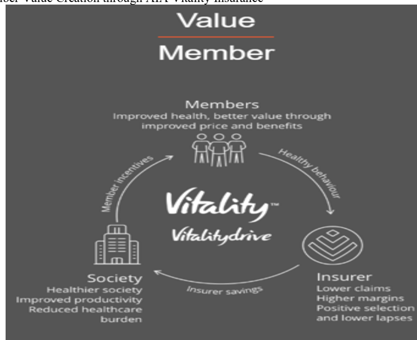
Figure 3: Member Value Creation through AIA Vitality Insurance

AIA Vitality, the most successful shared value initiative of AIA Australia, creates value through a threefold strategy (Figure 3: Member Value Creation through AIA Vitality Insurance): (1) members wellbeing (improved health at a better price), (2) social development (healthier society), and (3) insurer (lower claims and lapses). The AIA value creation framework is facilitating all three stakeholders – members, society and insurer.