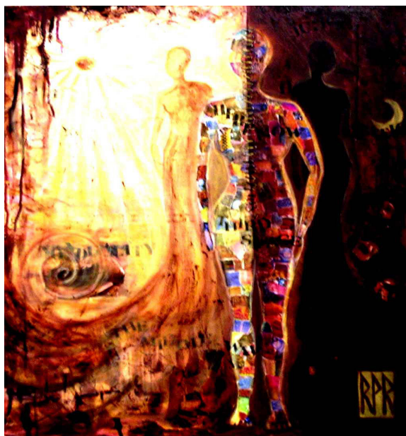
DSCN2308 Life Tapestries Collection

1. Available from: http://rprgallery.com/gallery/main.php , cited 2013 Sept 15.