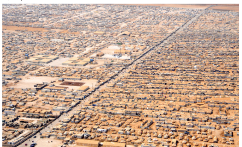
The population of the camp reached its maximum in April 2013 at 202,993 people. It currently hosts 79,900 persons (Available from: <a href="http://data.unhcr.org/syrianrefugees/settlement.php?id=176&region=77&country=107">http://data.unhcr.org/syrianrefugees/settlement.php?id=176&region=77&country=107</a>, updated 2016 Sep 18, cited 2016 Sep 25).

diabetes at the general medicine clinic; to complex murmurs, supraventricular tachycardia, a Tetralogy of Fallot, and long QT syndrome at the cardiology clinic. Although I was offered the responsibility of individually caring for patients, I preferred to work alongside more experienced physicians, as I felt I was not yet comfortable working in such a setting. In addition to extensively obtaining medical histories and performing physical examinations due to my good command of the language, I was taught the basics of operating an echocardiogram-this specific device being the sole one at the camp, a portable echo borrowed from the United States for this mission. Several translators were unable to attend, so I did serve as the primary means of communication between a few physicians and their patients, a task that was rewarding in itself. We also got to know a sma-Il number of nurses who were themselves refugees, although they told us that many of their colleagues and physicians in Syria had sadly not made it out of the war.