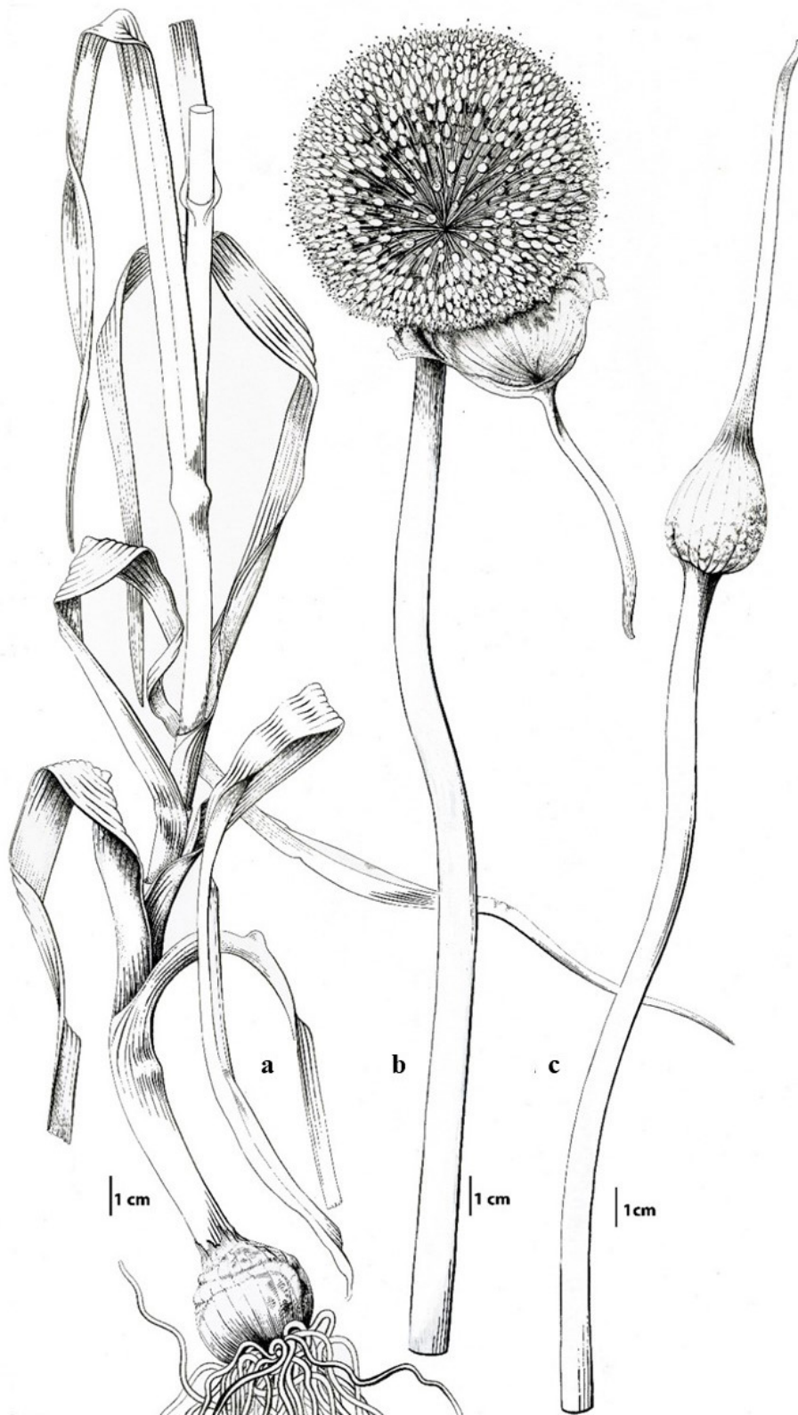
Fig. 1. Allium tuncelianum (Kollmann) Özhatay, B.Mathew & Şiraneci: a, b , plant during the anthesis; c , plant during the pre-anthesis [AEF 24116; illustrated by Gülnur Ekşi].