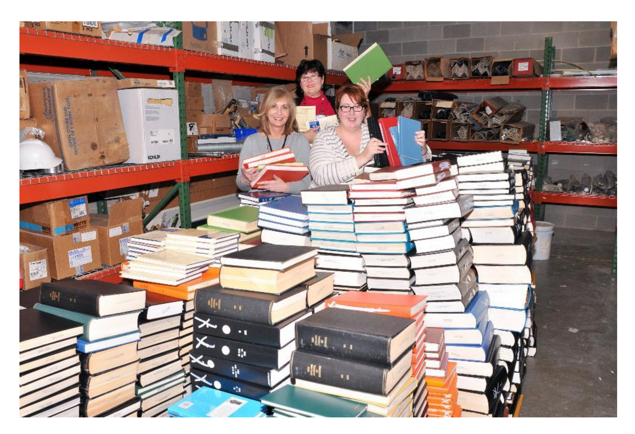
FIGURE 1: Approximately 3.38 tons of paper recycled during the journal weeding project

Weeded over 1/3 (4,300 volumes) of bound journal collection to make room for group study and individual study spaces.