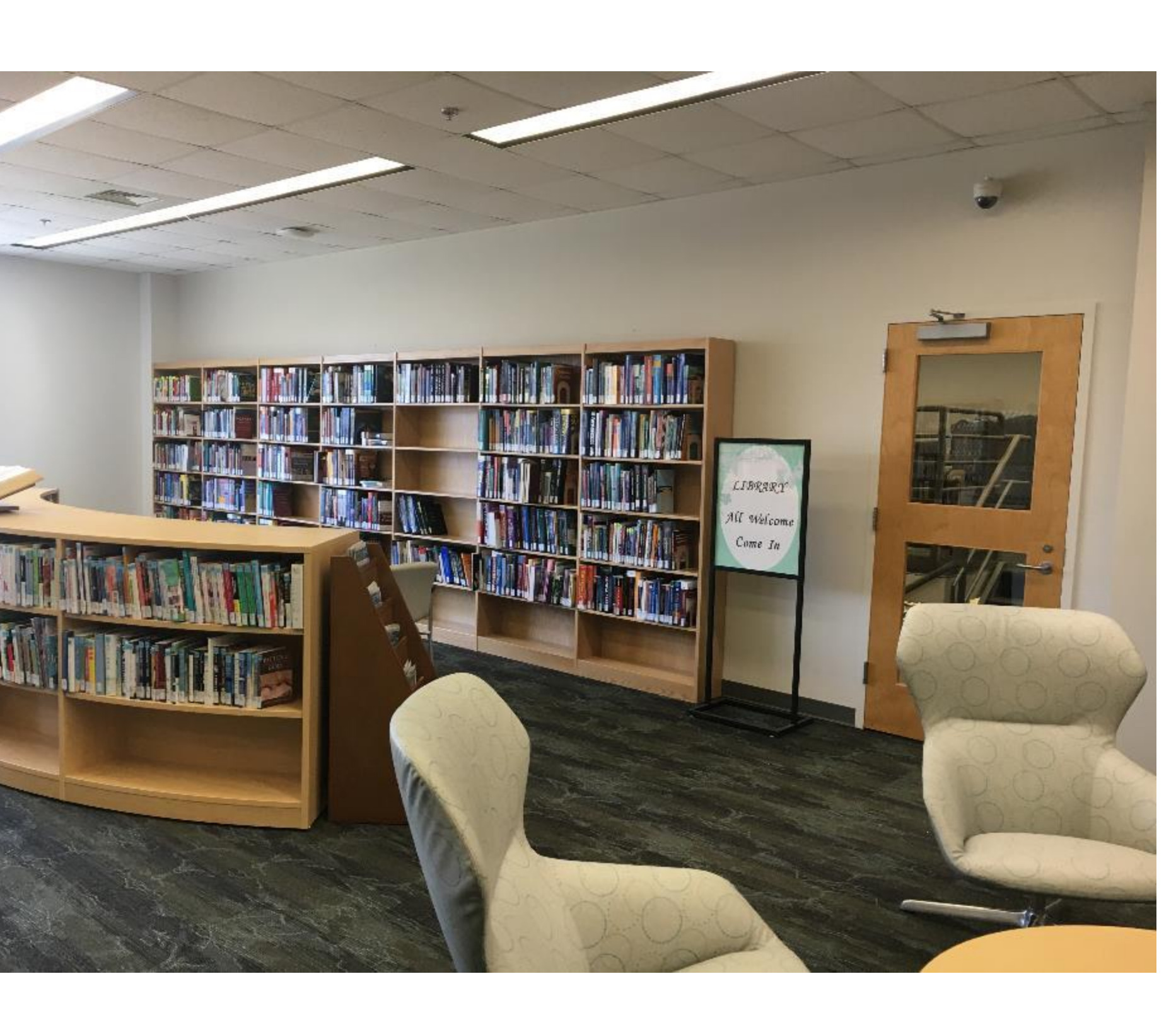
FIGURE 3: New Group Study Space used by Internal Medicine residents for rounds