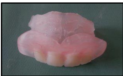
Figure 5. Labial view of the flexible prosthesis