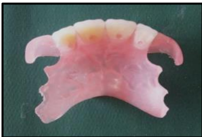
Figure 4. Palatal view of the flexible prosthesis