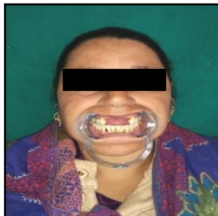
Figure 1. Preoperative view

• Firstly, alginate impressions were made and diagnostic casts were prepared (Figure 3).