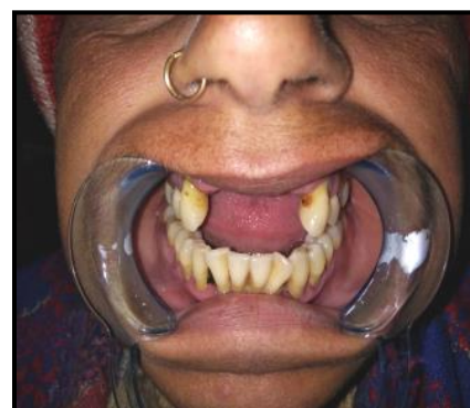
Figure 2. Intraoral view