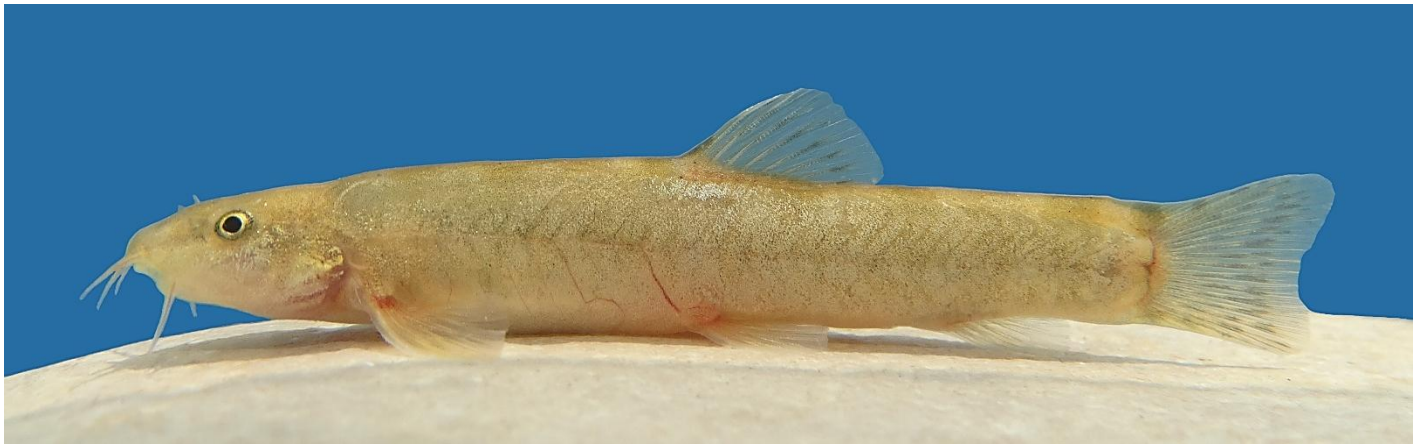
Figure 5. Paraschistura ilamensis , VMFC PSI3-P, paratype; 39 mm SL; Iran: spring Siahgav.