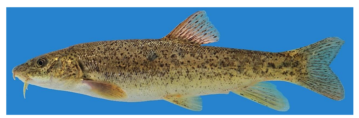
Figure 1. Live specimen of Barbus urmianus sp. nov., VMFC B1388, paratype, 130.1 mm SL, Iran: Western Azerbaijan prov.: Mahabad-Chai River at Miriseh village, Beytas Town, Urmia lake Basin.