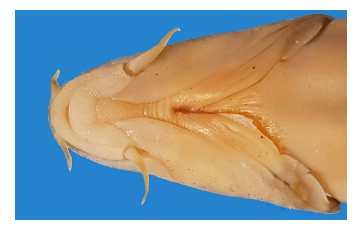
Figure 4. Ventral side of head of Barbus urmianus sp. nov.

Description: For general appearance see Figures 1–3;