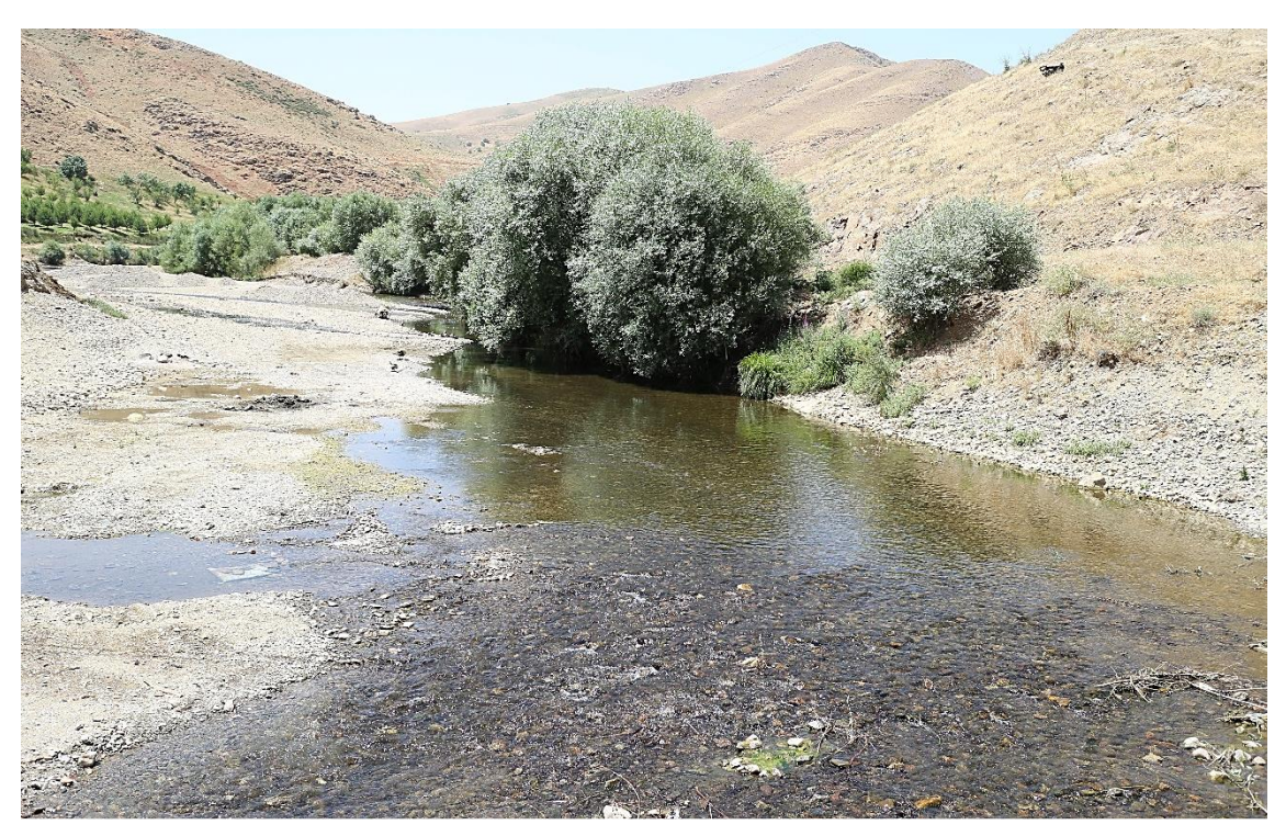
Figure 5. Mahabad-Chai River at Miriseh village, Urmia lake Basin, type locality of Barbus urmianus sp. nov..

peduncle, predorsal body profile convex, ventral profile slightly convex. Head deep tapering towards rounded, blunt snout. Dorsal profile of head slightly convex, with no marked hump between head and body. Caudal peduncle 1.7-2.9 times longer than deep. Triangular and pointed axillary scale at pelvicfin base. Pelvic-fin origin below vertical of last unbranched dorsal-fin ray. Caudal fin forked. Posterior dorsal- and anal-fin margins straight or slightly concave. Tip of anal fin, when pressed to body, passing middle of caudal peduncle. Pectoral fin reaching approximately 55-75% distance from pectoral-fin origin to pelvic-fin origin. Pelvic fin not reaching anus. Snout 48-72% of body depth at dorsalfin origin. Width of upper lip 4.5–7.5% HL. Lower lip thicker than upper lip, with a well-developed median pad (Fig. 4). Rostral barbel short, not reaching nostril; maxillary barbel 27-45% HL, reaching beyond the middle of the eye. Largest known individual 187 mm SL.