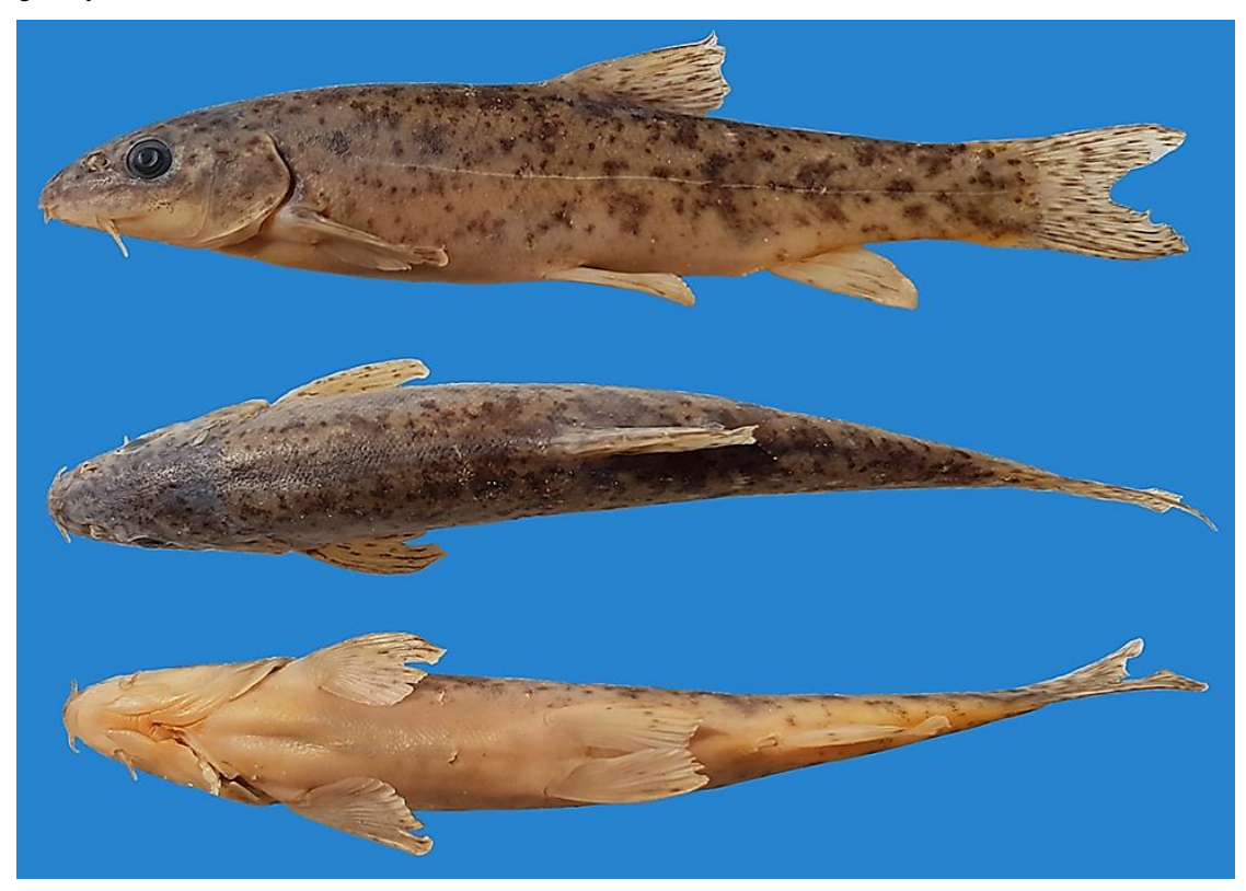
Figure 2. Barbus urmianus sp. nov., IMNRF-UT-1079-8, holotype, 117.7 mm SL, Iran: Western Azerbaijan prov.: Mahabad-Chai River at Miriseh village, Beytas Town, Urmia lake Basin.

Figure 1. Live specimen of Barbus urmianus sp. nov., VMFC B1388, paratype, 130.1 mm SL, Iran: Western Azerbaijan prov.: Mahabad-Chai River at Miriseh village, Beytas Town, Urmia lake Basin.