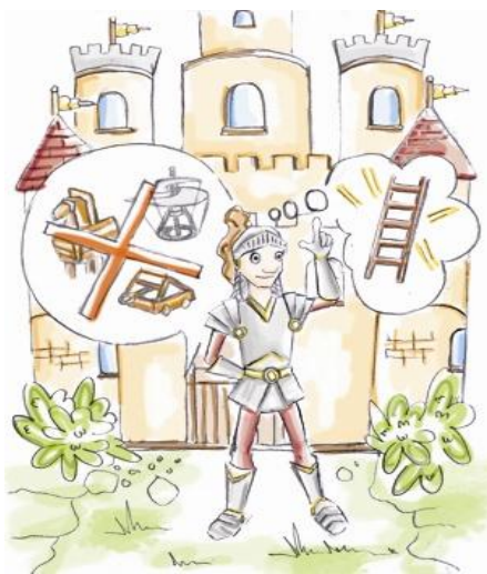
Figure 6. Immutable Process

of seeking new knowledge when developing the process, losing the possibility of improving the process (Figure 6).