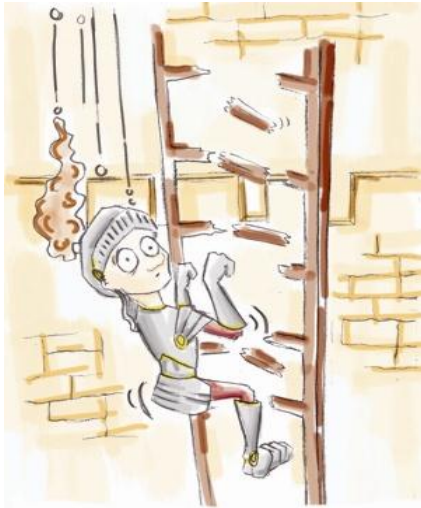
Figure 9. Domino Process