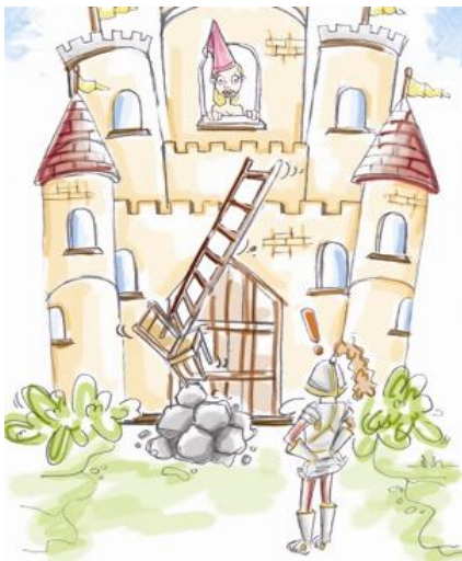
Figure 4. Casual Process

Conducting a software process often becomes an ad hoc activity, resulting in improvisation of the tasks. Such type of work takes place when an organization is not aware of the importance of processes and usually ends up diverting all the workload onto development activities. Ad hoc processes arise primarily because there is not a process manager who guides the selection of at least one process to perform. Ad hoc processes are not aware of the roles and end up creating handyman roles, promoting anti-patterns that generally resemble the project management anti-patterns [1]. An ad hoc process ends up extending schedules, repeating efforts and consuming resources. Because the process is not clearly identified, it may end up taking different names from a list given by the participants, which is usually inconsistent. A casual process tends to be confused with an organization's customized process, therefore, care must be taken when the course of the process has features like those listed above. (Figure 4)