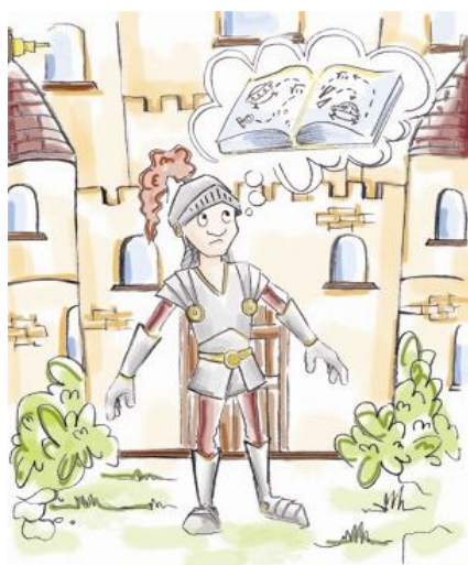
Figure 7. Process without evidence

Usually, software development processes involve creating documents related to the product being made, such as developing manuals and user manuals, among others. However, a document of the process itself, which at least provides information about what was learned from the process execution, is a task that is never performed. When the process lacks evidence of its execution, it is highly probable that the same actions will be re-executed with the same fundamental flaws. These side effects result in process delays, repeating and perpetuating defects. Processes without evidence, are a sign that there is no process manager, who leads the process and records its past history for new process implementations (Figure 7).