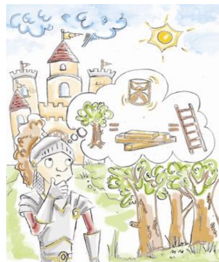
Figure 8. Process without rhythm

A software development process should try to keep a sort of rhythm in each of its activities so that there are no gaps that hinder efforts and resource investment from efficiently contributing to constituent-workflow tasks. It is common to find elongated-time activities, while other activities are time-constrained, the proportions of time allocation must be fair without causing trauma. The time resource should be one of the main variables to govern the processes, the workflow must balance the periods of time employed in each activity, thus avoiding botched executions. A process without rhythm occurs when other antipatterns are inserted, such as paralysis of analysis or design by committee [1]. In these harmful practices, it is evident that the imbalance in a specific activity impedes the normal execution of the remaining activities (Figure 8).