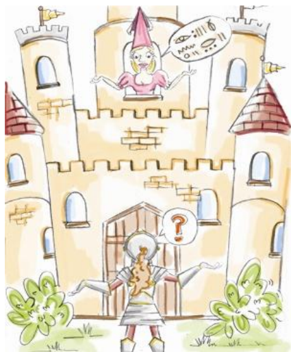
Figure 12. Process without Communication