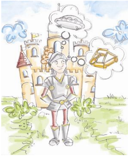
Figure 3. Extreme Process