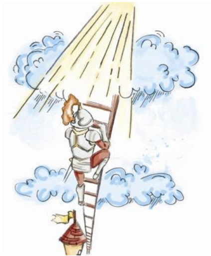
Figure 1. Top Process