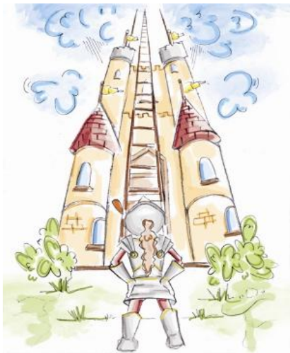
Figure 10. Perpetual Process

When a process becomes interminable is said to be a perpetual process . Generally speaking, the process falls into infinite loops when the workflow is repeated without generating useful products. This type of process is evidence of the immaturity associated to the organization that runs the process as well as of its lack of adequate estimation, its failure to meet the requirements and development. Such immaturity is most obvious when in the testing phase, where developers will need to constantly repair things, with the aggravating circumstance that these repairs might cause further inconveniences. In the perpetuity of the process there is no proper configuration management, and quality control is summarized in trying to fix an accumulation of defects that cause poor reliability [10] of the results obtained at a particular point of development. When a process becomes perpetual, it usually ends abruptly with negative collateral implications for the participants (Figure 10).