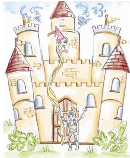
Figure 5. Slide Process

Adopting a process that encourages the production of outputs from a given input regardless of the way in which workflow occurs is generally counterproductive. Software processes should not be slides, which do not pay interest to the way results are obtained, since in the workflow participate a society of roles that may be sacrificing not only the quality in the process, but most importantly, sacrificing performance conditions and quality of life. In a slide process, it is typical to start at a certain speed and finish with acceleration. In the same way, a process without rhythm [2] starts with extended times in its initial phases and have tight schedules in development and deployment phases. A slide process does not control time, delaying projects; it also accelerates at critical stages, sacrificing product quality. These processes end up adjusting schedules, paying fines, conducting renegotiations, and making considerable losses for the organization (Figure 5).