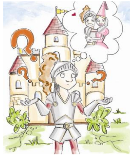
Figure 11. Headless Process

Poorly managed processes, and /or processes with leadership problems in the various disciplines, are referred to as headless processes. This type of process does not define clear functional objectives and responsibilities, there is a poor identification and assessment of the roles and therefore there is no adequate assessment of the disciplines; activities usually focus on the production of code without ensuring appropriate quality conditions; moreover, ad-hoc delegations occur. Headless processes exhibit exaggerated rotation of staff, stalling the workflow and leading to an abrupt end with unfavorable implications for the parties involved (Figure 11).