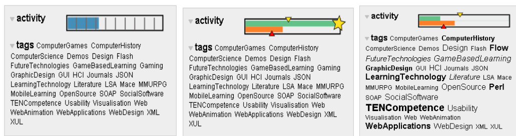
Fig. 1. Sample Indicators on different strategy levels

The purpose of the indicator layer is to integrate the values selected by the control layer into the user interface of the community system. The indicator layer provides different styles of displaying and selects an appropriate style for the incoming information. Two graphical and one widget indicator are provided by the prototype. One graphical indicator is used during the first level of the control strategy. This indicator shows the amount of actions for the last seven days. A second control strategy uses a different graphical indicator. It displays the activity in comparison to the average community member. The maximum value of the scale used by this indicator is the most active community member. Finally, the indicator layer provides a tag cloud widget for displaying the interests of a learner. In principle this widget is a list of hyperlinks. The tag cloud indicates higher interest values for each topic through the font size of the related tags.