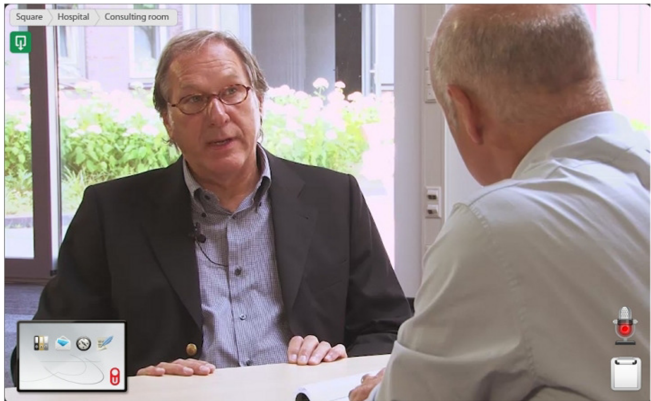
Figure 1. A patient being interviewed. At the bottom left, we see the tablet, and at the bottom right, we see the memo recorder and notepad.

expert reports. The student gets navigation support through alerts, e.g., reminders for meetings or instructions for where to go next.