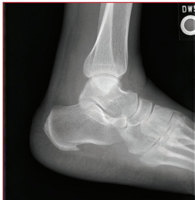
Figure 1: Lateral ankle radiograph of the patient on presentation demonstrating a small joint effusion.

The patient initially presented to the orthopedic service after acute worsening of her symptoms. She sought care in the emergency department on 12/27/12 after four days of severe left ankle pain with inability to ambulate. Examination at that time demonstrated a joint effusion with tenderness to palpation around the ankle joint. She had limited range of motion secondary to pain and an intact neurovascular exam. WBC count was 6.6, ESR 84, and CRP 12.2. Radiographs were unchanged. A repeat aspiration was performed. Total nucleated cell count was 2400 with 96% neutrophils and no crystals. An MRI was obtained which demonstrated nonspecific talar body edema with synovitis and a small joint effusion (Figure 2). Initial cultures were negative, and the patient was discharged home with pain medications. Positive acid-fast bacillus cultures resulted 15 days later and demonstrated growth of multi-drug resistant Mycobacterium tuberculosis . She was taken to the operating room on 1/17/13 for arthroscopic irrigation and debridement of the left ankle and had significant