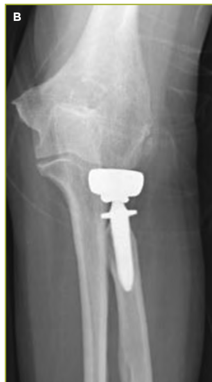
Figure 4. Representative radiographs of a patient at 3-year follow-up. A) Anteroposterior view of the elbow. B) Lateral view of the elbow.