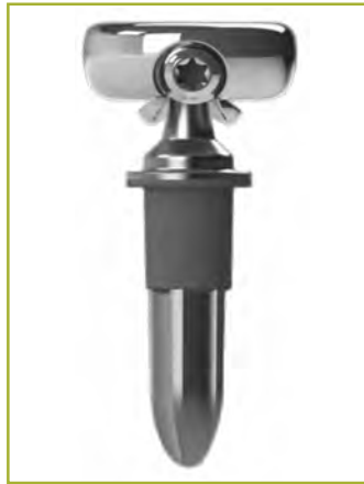
Figure 2. The ALIGN implant (ALIGN Radial Head System, Skeletal Dynamics, Miami, FL).

The ALIGN radial head implant (Figure 2) is a cobalt chrome, side-loading, monoblock implant designed to be anatomically aligned to the patient's axis of forearm rotation by means of an alignment jig (Figure 3). A long stem provides three-point, press-fit fixation and has a TPS coating. The implant is installed in a modular fashion, until a lock screw secures the head to the stem,