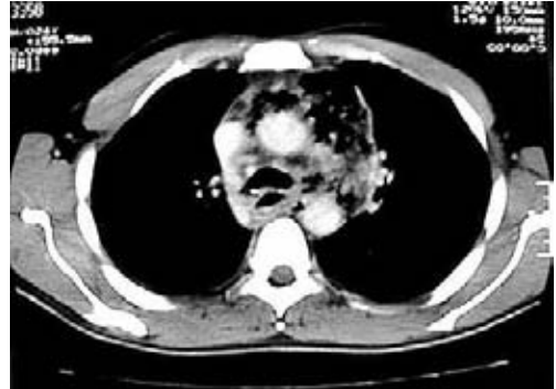
Figure 2. CT of the mediastinum: mediastinal purulence and clear lungs.

the patient was cardiocirculatory instable, with abnormal coagulogram, haematogram and hepatogram. Daily follow-up chest X-rays were performed, and on the 7th day after thoracotomy the follow-up chest X-ray showed lower transparency of lung lobes, indicating a follow-up thoracic CT was required. The CT scan demonstrated enormous bilateral pleural empyemas, with a marked reduction in respiratory space and a paracardial purulence (Figure 3).