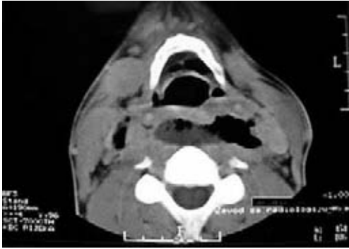
Figure 1. CT of the neck: fluid and gas collections in the retropharyngeal compartments.