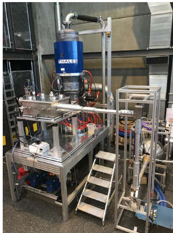
Fig.1. Layout of the experimental setup used for long-pulse characterization of the dual-frequency gyrotron. Via an evacuated MOU (rectangular metallic box), the rf-power at the two frequencies is transmitted to the evacuated high-power load [6] using a HE 11 (63.5mm diameter) evacuated waveguide.

Short-pulse ( \leq 20ms ) and long-pulse operation ( \geq 500ms ) has been successfully achieved during the commissioning phase without facing any issues. For long-pulse operation, a novel power deposition scheme on the gyrotron collector, based on an AM modulation of the collector sweeping coil, has been fully validated and ensures an homogenous power distribution along the collector walls [5]. The experimental set-up during commissioning is shown in Fig.1.