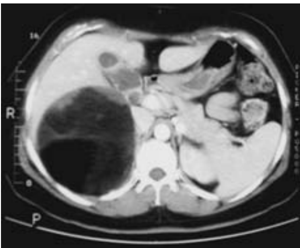
FIG. 1. Abdominal CT scan in a 37-year-old woman who presented to our department with vague right abdominal discomfort of 4 weeks' duration. The large adrenal mass is composed mostly of fat with well-defined borders.

Imaging. Most adrenal myelolipomas are asymptomatic. Symptoms associated with large myelolipomas are typically vague and include back or abdominal pain. Ultrasonography, CT, and MRI are effective in diagnosing adrenal myelolipomas in more than 90% of cases, with CT being the most sensitive diagnostic imaging modality. (12,13) Myelolipomas appear as well-delineated heterogeneous masses with low-density mature fat (less than -30 Hounsfield Units [HU]) interspersed with more dense myeloid tissue (Figure 1). (14) A fatty adrenal mass is virtually diagnostic of myelolipoma, although other less