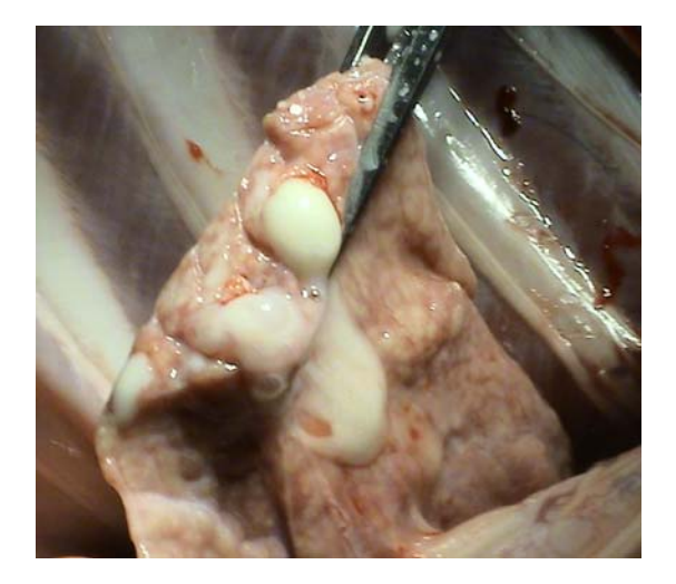
Fig. I: Lungs of goat infected with Mycoplasma mycoides capri showing gross abscessation.

al. (2004). They observed that during the experimental trial of infection the disease showed a mild and chronic course. These differences in results might be due to the difference in age of experimental goats (12-15 months). Secondly, Wesonga et al. (2004) infected the animals with different species of Mycoplasma, i.e., M. capricolum subspecies capripneumoniae , for experimental production of disease. In the present study, the animals were at the age of 2-3 months and the species was Mmc. Another unique finding of the present study was the absence of joint inflammation. Similar findings were reported by Laura et al. (2006) working with CPP caused by Mmc. However, these findings were contrary to the study conducted in the same country by Awan et al. (2009) who reported lameness and arthritis in the forelimb of infected goats. The reason may be due to the difference in species of Mycoplasma.