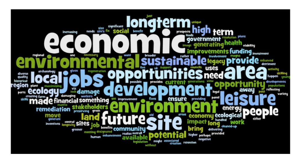
Fig. 1. Word cloud of what should matter in determining the future of the former steelworks site.

In summary, the information from the pre-workshop survey prompted us to look again at stakeholder groups for nuances in