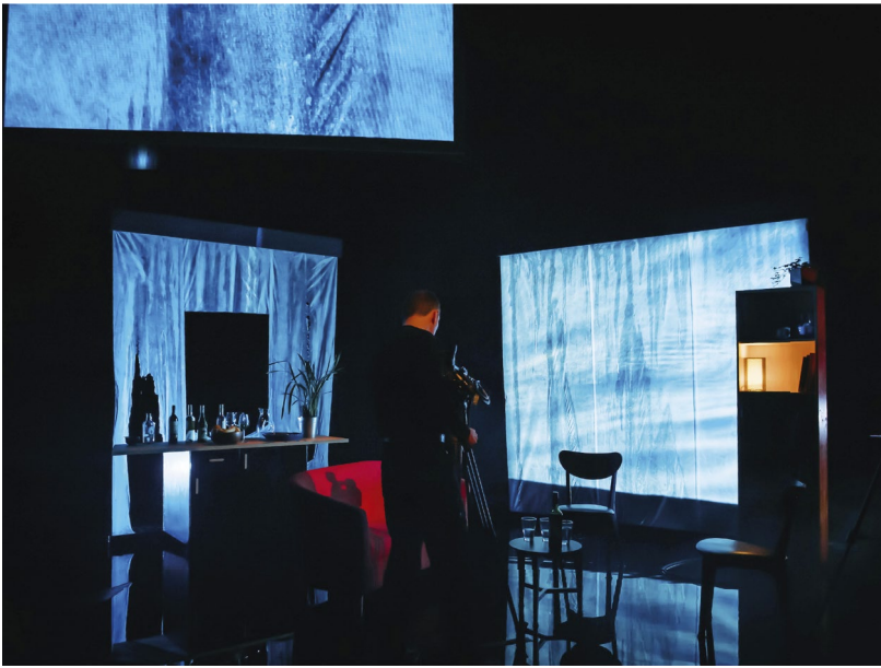
■ Climate breakdown and the refugee crisis are part of the same story.

Oh yeah that's what they say. 'You need to have children to understand it ... You wouldn't understand because you don't have any children' ... So then what happens is [sic] everything [sic] your house, your home, your comforts, where you live ... You just go, 'It's all about my children, my kid' ... And you're deemed to be a blessed person because you protect that function ... Where's collectivity? What about other people's suffering ... This idea of protecting your own. It just promotes that selfishness ... So maybe the only way you can really understand what's going on with someone else is to imagine it's your own kid. And if that means seeing a picture of a dead baby on a beach or a baby's body floating in the water or a baby blown to pieces by a bomb and buried under the rubble then so fucking be it. (Vanishing Point 2016)