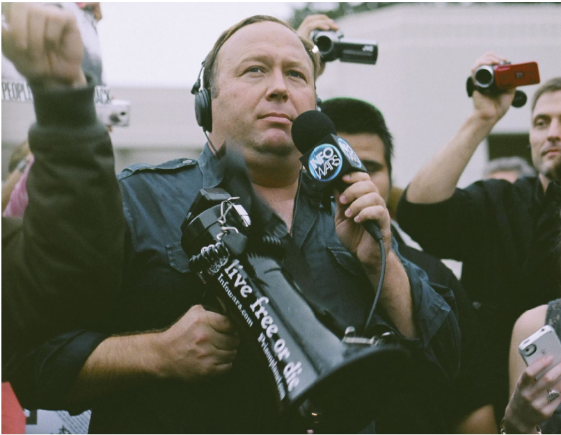
■ Alt-right activist and host of InfoWars Alex Jones.

effective action by governments suggests we do not yet possess a verbal language to express the terror it will spread. I argue in the conclusion that The Destroyed Room makes a powerful case for the theatre to provide a space for audiences to imagine new futures for humanity outside of digital spaces. This is not an essentialist positioning of theatre against the commodified systems operating within late capitalism, but a celebration of theatre as a vital practice for humanity to experiment with new forms of global co-existence. 3