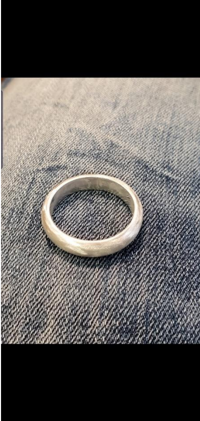
sterling silver, 2019