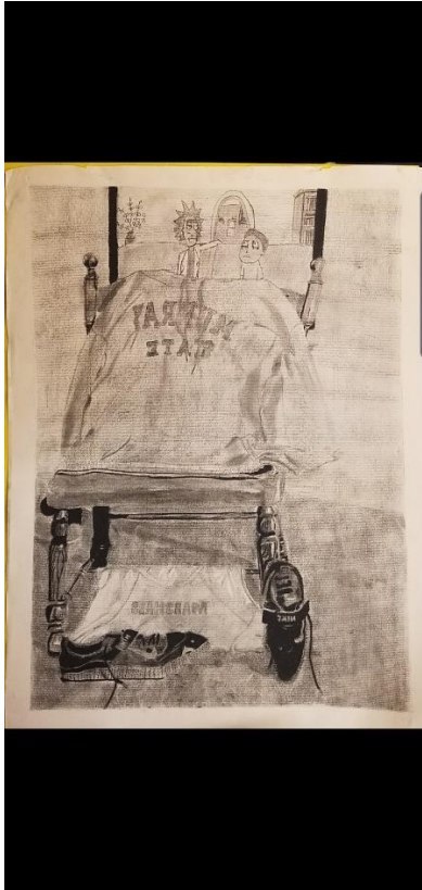
charcoal, 18x24, 2017