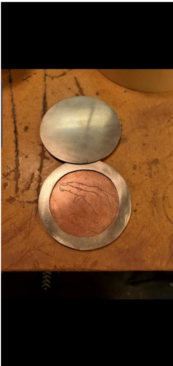
nickel and brass, 2019