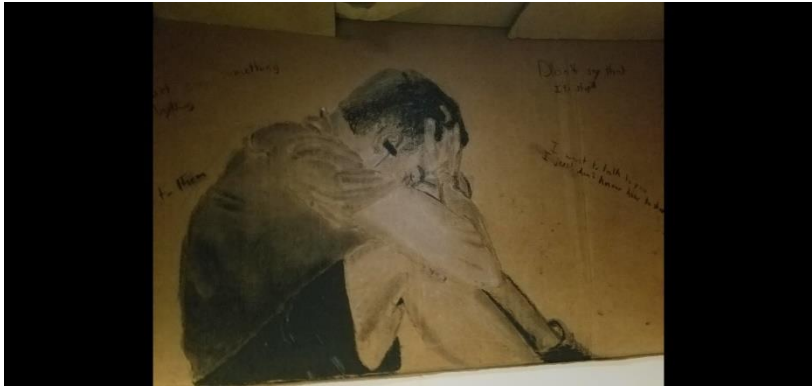
charcoal on cardboard, 2018