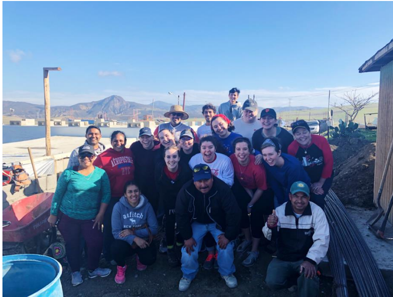
Seattle University Campus Ministry Team with FEM staff