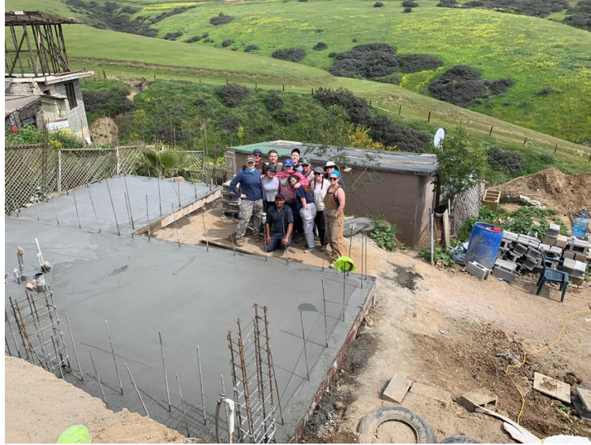
Seattle University team and community members in front of completed concrete floor