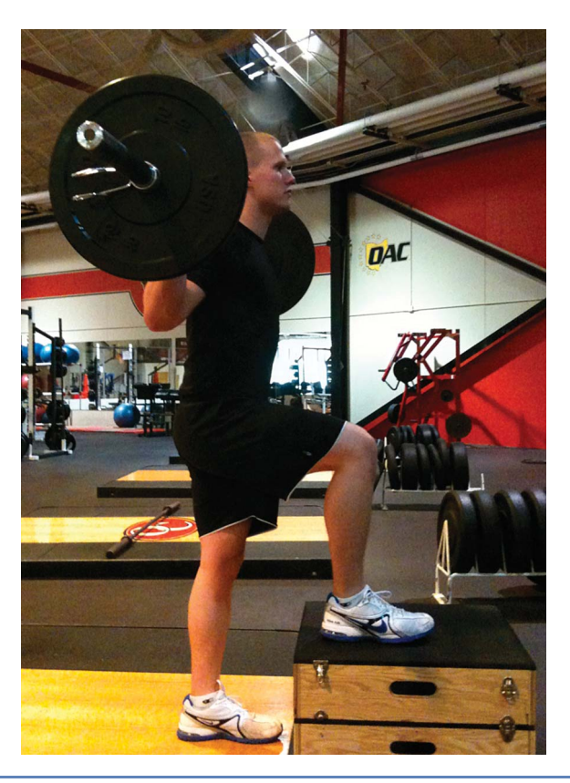
Figure 3. Step up on a box.