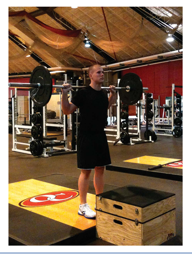
Figure 1. Starting position.

Vertebral column stabilizers (external and internal obliques, transverse and rectus abdominis, erector spinae muscles, and quadratus lumborum), hip flexors (iliopsoas, rectus femoris, sartorius, and tensor fasciae latae), hip extensors (hamstrings and gluteus maximus), knee flexors (hamstrings and gastrocnemius), and knee extensors (rectus femoris, vastus