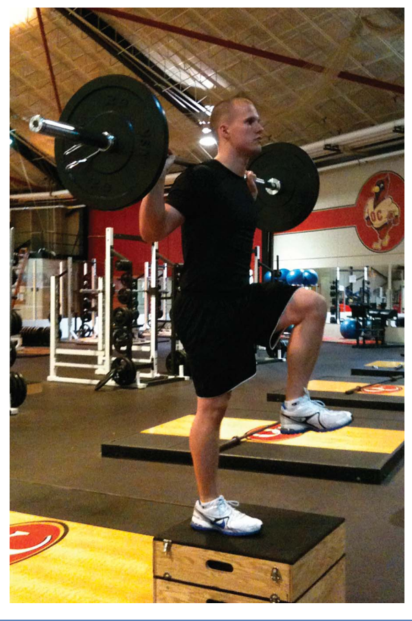
Figure 4. Hip flexion on a box.

left thigh should be parallel to the floor.