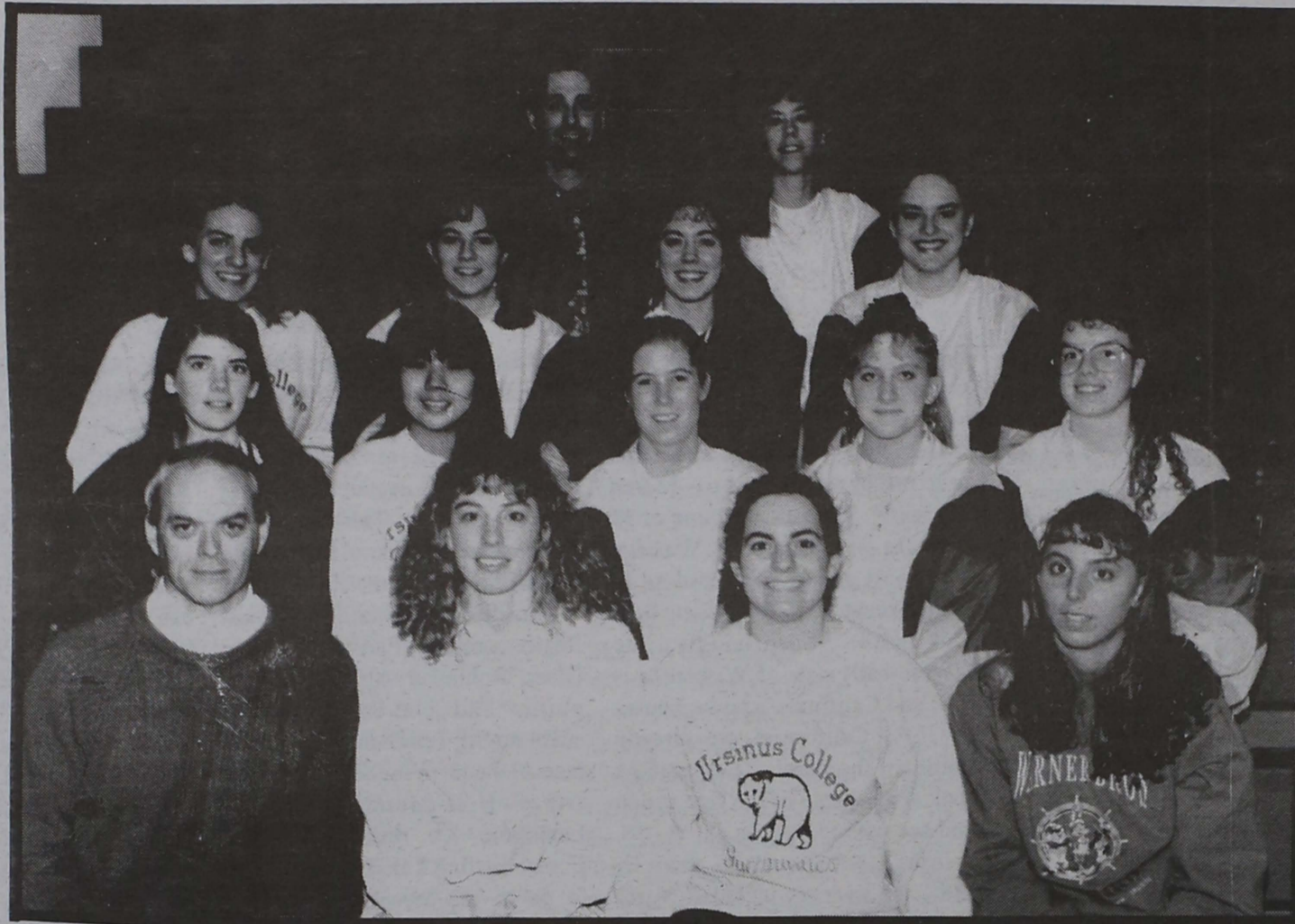
The Ursinus Gymnastics team sits still for a minute after a hectic weekend of competition; last weekend, they hosted the NCAA Division III Nationals.