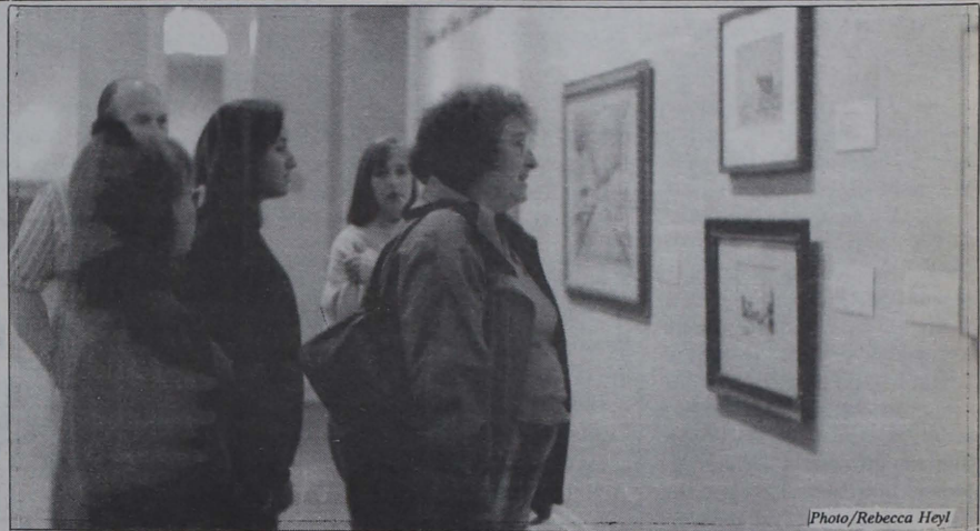
Ursinus parents enjoy the Berman Art Museum.