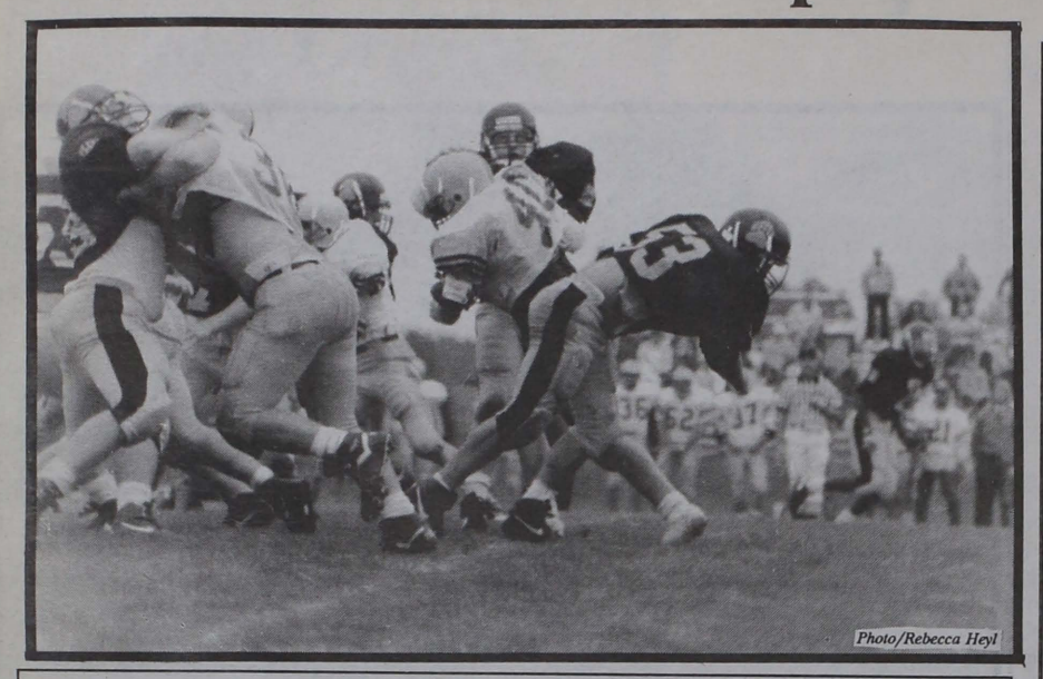
Ursinus slugs its way through a muddy Parents' Day game this past Saturday.