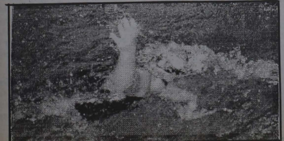
Shark attack remains.