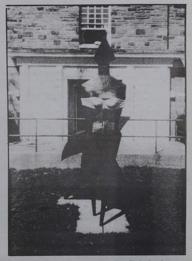
A 65D is a rare commodity, even if you're a Chadwick sculpture.