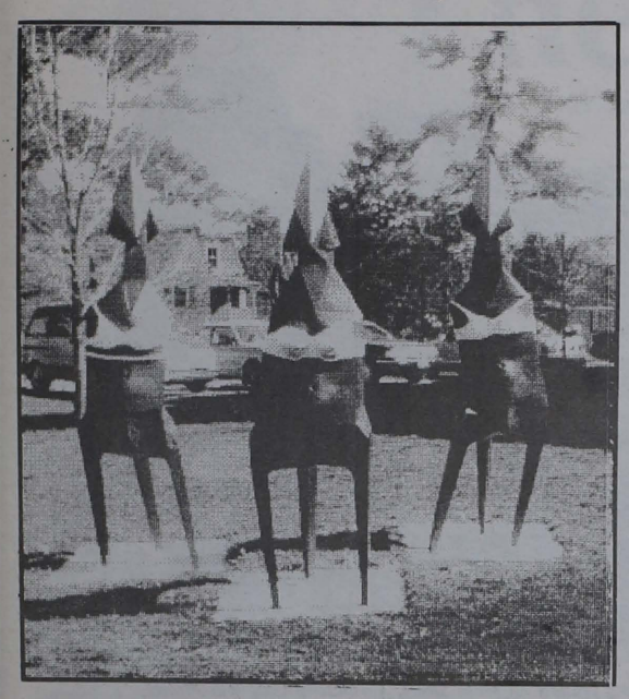
Three Chadwicks, more fully attired.