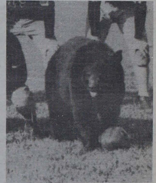
8, 9, 10:00 a.m. to 2:00 p.m.; and October 30, 1:00 p.m. to 5:00 p.m.

Featuring such esoteric items as leather nose guards from the 1890's padded football jersey's and archival photos of a 300-pound black bear mascot named "Zackie", posing as a lineman, "Courage and Pride" will open to the public, weekdays, Tuesday through Friday, 10:00 a.m. until noon and from 1:00-4:00 p.m.. Weekends, the exhibition will be open on the following dates: September 24, 25, 10:00 a.m. to 2:00 p.m.; October