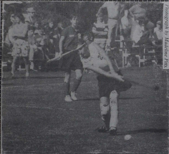
Photograph by Madeline Pius