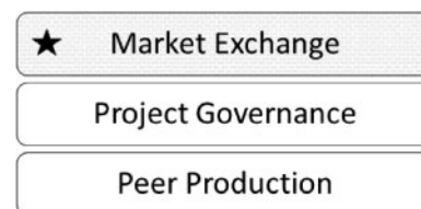
Figure 3. Security of Open Source Software can be implemented in all layers. At the lowest layer are the tools of generic peer production, e.g. with GitHub's warning for outdated dependencies. At the next layer are governance decisions where secure engineering practices are enforced, e.g. through the CII Best Practices Badge. Our market place sits on top of that and provides additional incentives to guide attention of developers and users.

The marketplace can also highlight those software projects that adhere to existing best practices. For instance, projects that follow secure software development practices (e.g. earned a CII Best Practices Badge 3 ) may have a different price equilibrium from non-secure software projects. Market participants may be willing to pay more for open source projects that are known to follow these best practices and are thus more likely to be secure.