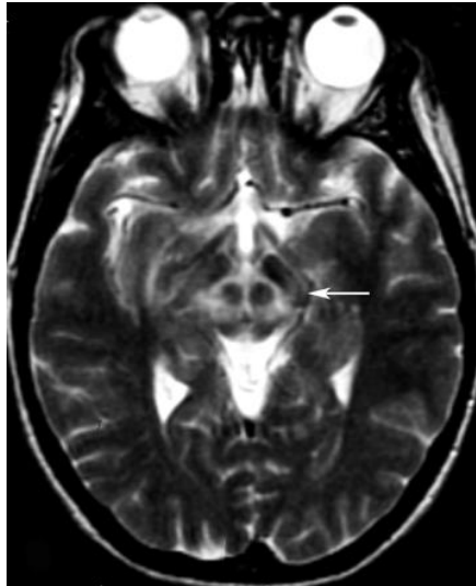
Figure 2: Panda face on MRI - classic for a patient with Wilson's disease and copper deposits in the brain (from Jacobs, 2003)

Ceruloplasmin level measured 7.9 mg/dL (normal: 20-35 mg/dL). A 24-hour urinalysis showed a copper level of 247 \mu\text{g} (normal: 20-50 \mu\text{g} per 24 hours), which completed the work-up. This teenager was officially diagnosed with Wilson's disease. Penicillamine, which works by chelation and increasing urinary copper excretion, was started.