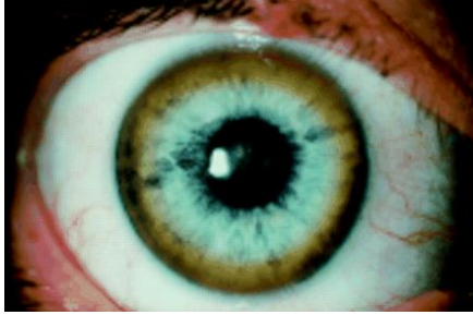
Figure 1: Kayser-Fleischer ring due to copper build-up in the human cornea (from Sullivan, 2002)

If Kayser-Fleischer Rings are absent but there is a high suspicion for Wilson's disease, a liver biopsy can be performed. Chelation therapies (penicillamine and trientine), zinc salts, and a low copper diet are mainstays of treatment. A liver transplant is the sole curative treatment for patients with hepatic disease. 2 This is reserved for cirrhotic patients and those with fulminant liver failure. 4