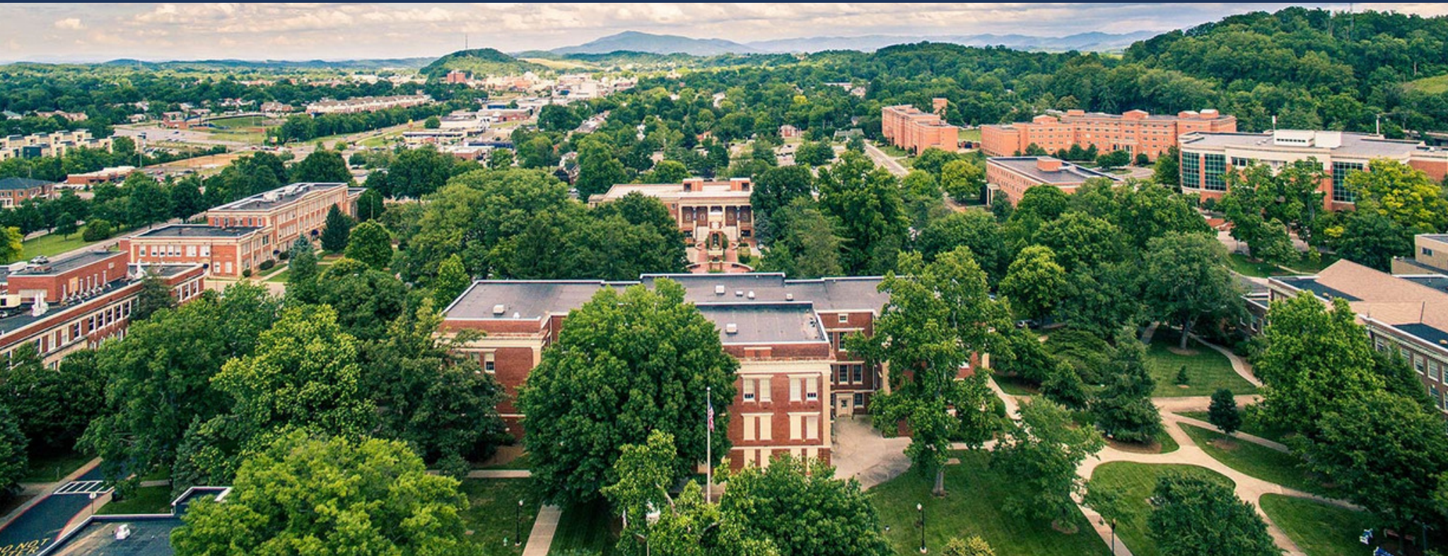
Ariel view of ETSU campus 4