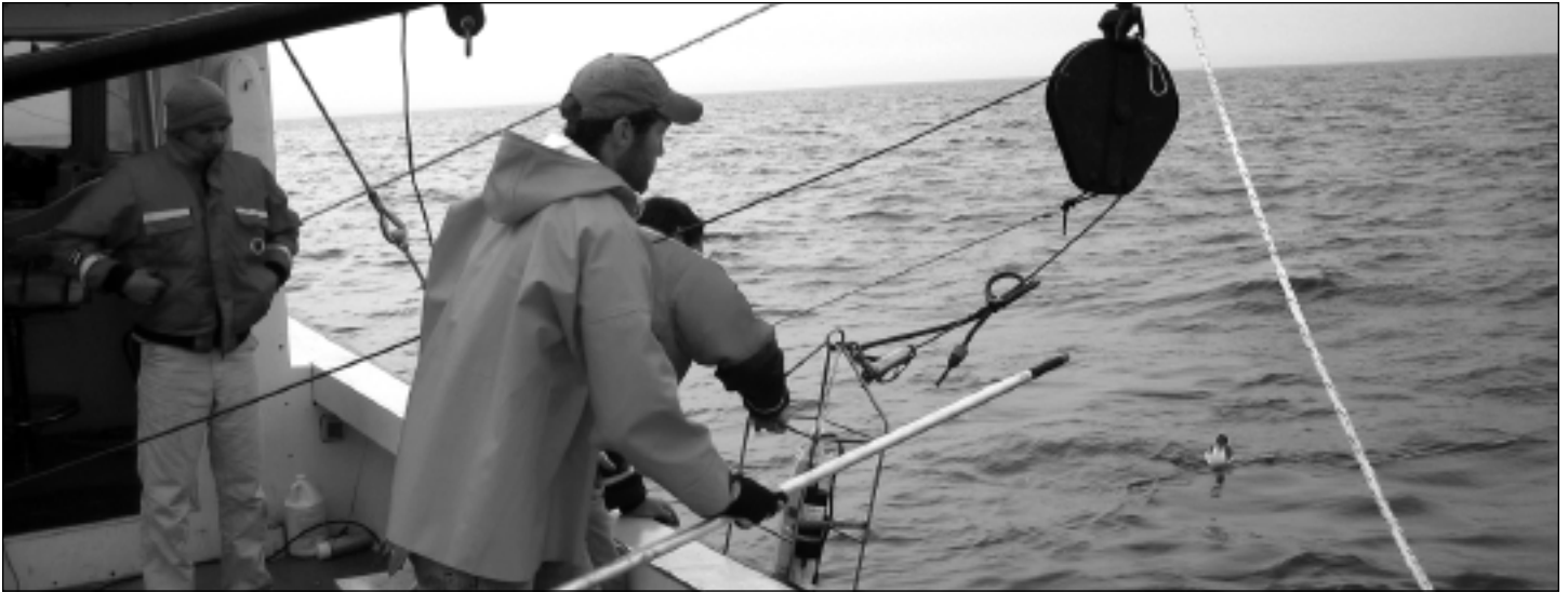
Undergraduate student participation in research is on the rise at USM. "Thinking Matters," a two-day celebration of student achievement, showcased more than 170 presentations of original research and student-faculty collaborations.