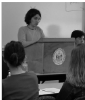
Undergraduate student participation in research is on the rise at USM. "Thinking Matters," a two-day celebration of student achievement, showcased more than 170 presentations of original research and student-faculty collaborations.