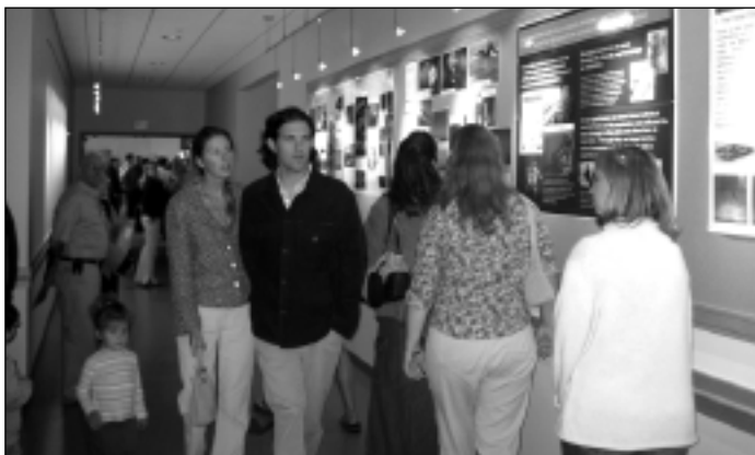
Visitors to the new USM Aquatic Systems Offices at the Gulf of Maine Aquarium in Portland.

postdoctoral student joined the staff of the Maine Center for Toxicology and Environmental Health (MCTEH). As part of its biosciences initiative, USM also added support for one doctoral student, bringing the number of Ph.D. students at USM from five to six.