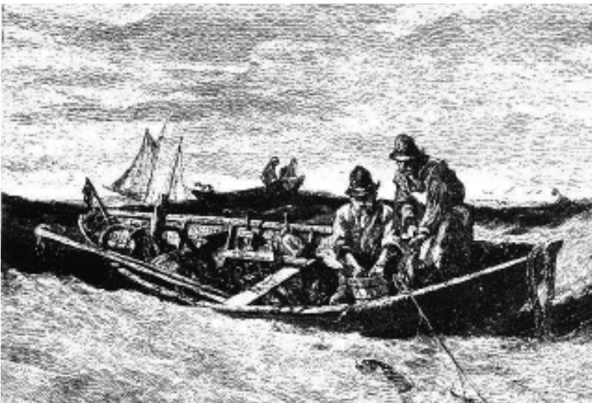
Inshore fishermen working their cod lines from a dory in a vigorous downeast swell. Engraving in Harper's Magazine , 1880, courtesy of the author.

Thus by the mid-1880s, the second generation of Schoodic settlers, having lost almost all the economic advantages that had drawn their