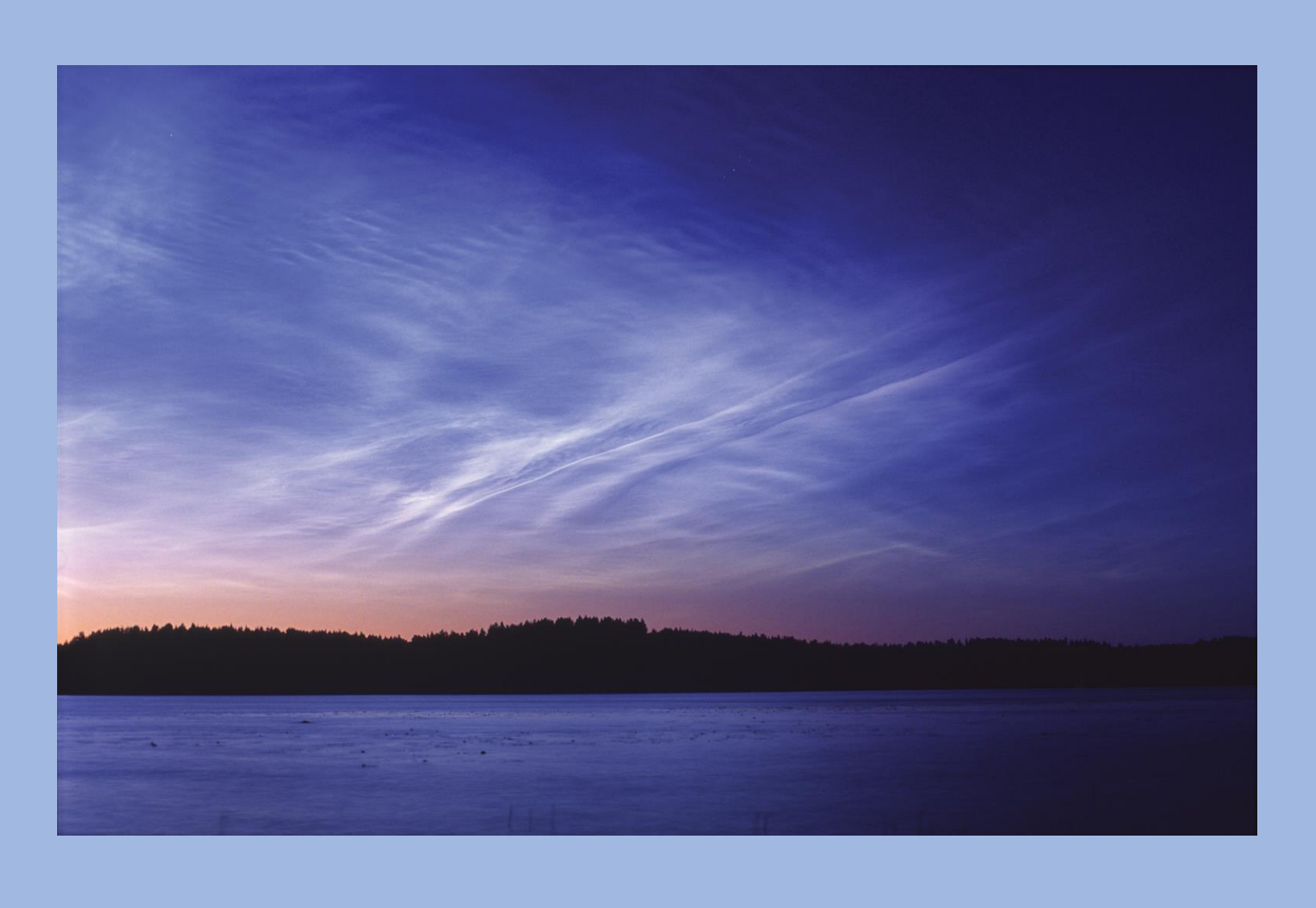
Fig. 2. Noctilucent Cloud [4]