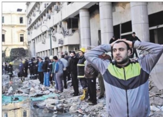
An Egyptian man on Friday stood in the rubble of a deadly explosion at the Egyptian police headquarters in downtown Cairo.