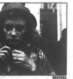
A protester buckles her helmet as she stands guard outside the parliament building in Kiev.