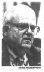
Rep. James Sensenbrenner (R-Wis.), referring to the Journal Sentinel's "Backfire" series on problems with ATF stings