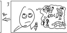
3 Ideas surrounded by blurry thought bubble. Brainstorm may also be video montage surrounded by blurry frame.