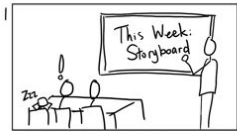
1 Establishing shot of classroom. One student snoring. One sits up in alarm over assignment.

Break out your inner artist. It doesn't have to look pretty but this is a crucial step.