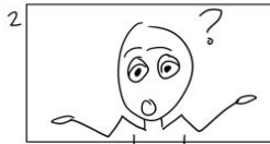
2 Student feels overwhelmed. Voiceover: "I've never done this!" Camera pans slowly to make space.